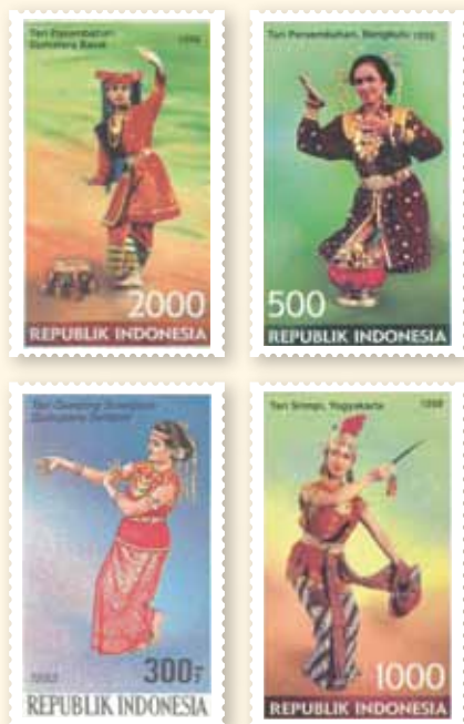
Various dances of Sumatra on stamps.