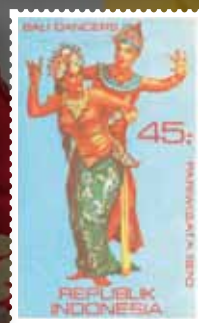
Main image: Tari payung dancers; Stamps (clockwise from top left): Wayang Wong , Arsa Wijaya , Kecak , Tambullingan (bumblebee) dancers, Baris Gede dancer, Cirebon