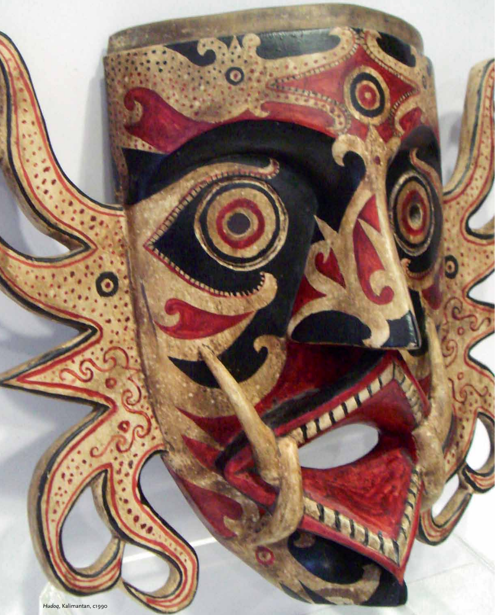
Hudoq, Kalimantan, c1990