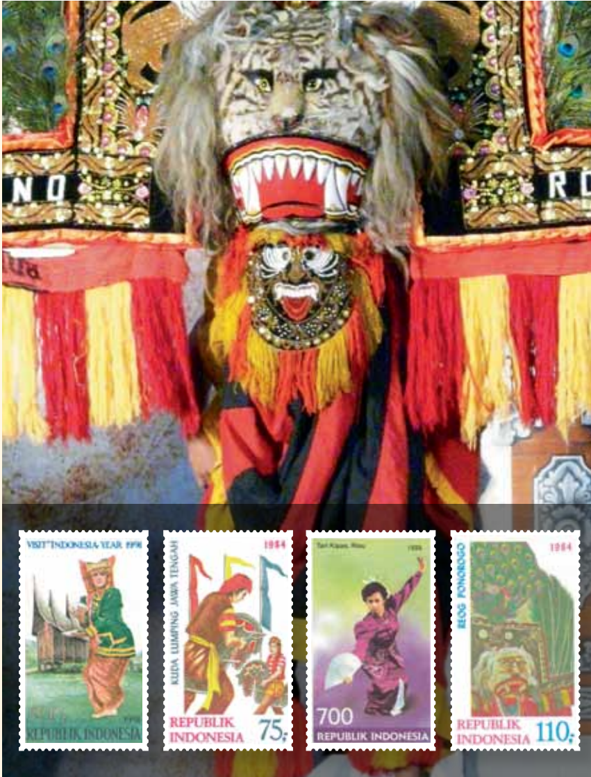
Main image: The Reog dance; Stamps (from left): Saucer dance, Kuda Lumping , Fan dance, Reog .

order. Two gatekeepers stand on both sides of the door to the spiritual temple. There are many versions of the gunungan depending on the local culture and social situation. Javanese gunungan have more symbols compared to those from Bali.