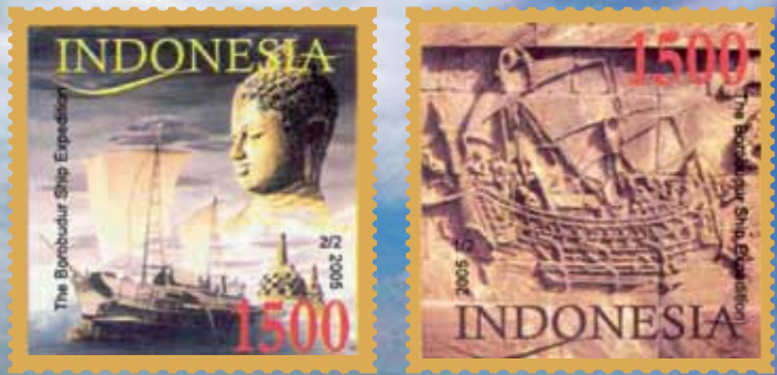
Main image: Beach in Flores, East Nusa Tenggara, Photo by Kiat. Stamps: Borobudur Ship Expedition