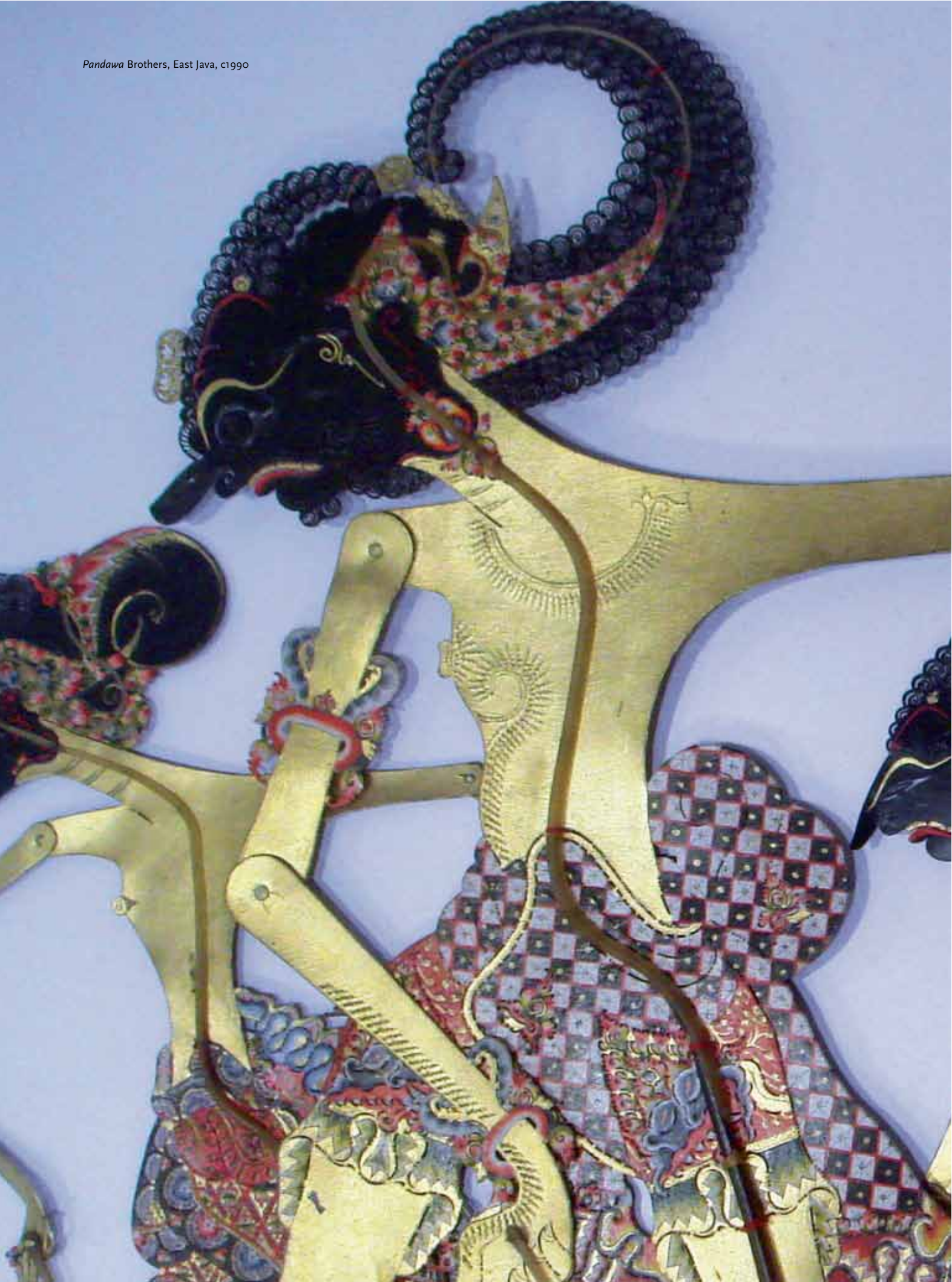
Pandawa Brothers, East Java, c1990