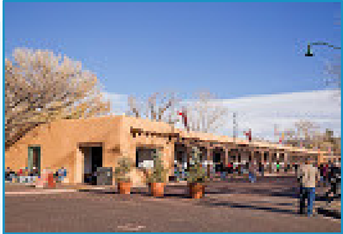
Many other Art & Cultural Museums in the area are open 10am to 5pm daily.