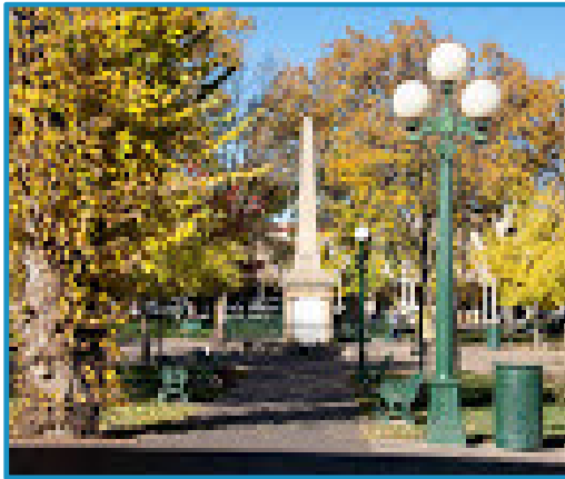
Historic Santa Fe Plaza features Spanish and Native American culture, restaurants, shops, art, and more.