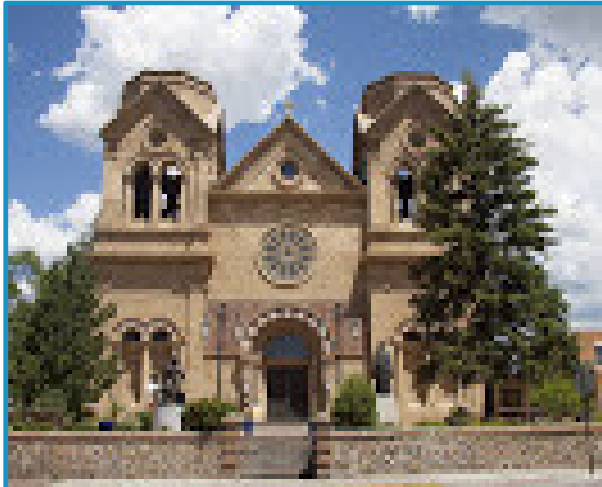
Cathedral Basilica of St. Francis of Assisi, built in 1869, also known as the St. Francis Cathedral.