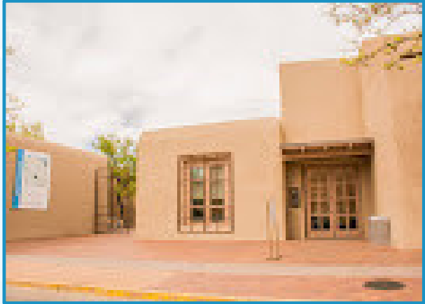
Georgia O'Keeffe Museum, open 10am to 5pm daily and until 7pm Friday.