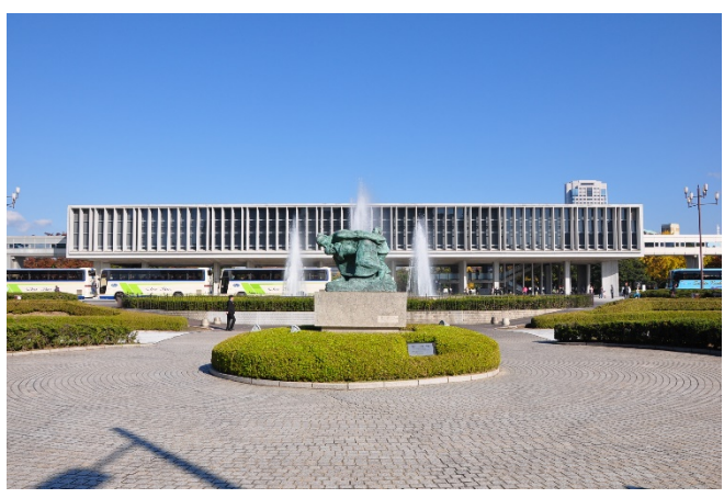
Hiroshima Peace Memorial Museum