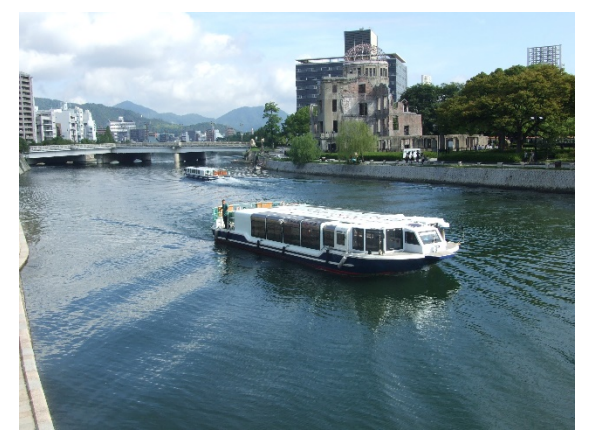
A cruise on an excursion ship: Genbaku Dome and the world heritage site