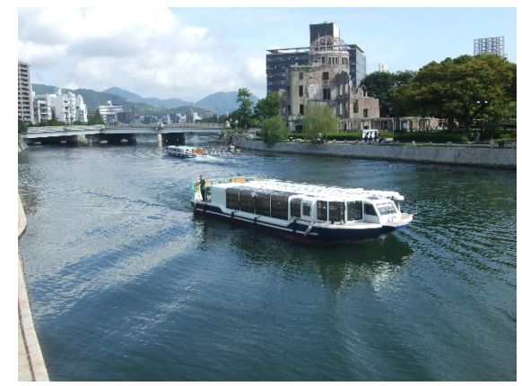
A cruise on an excursion ship: Genbaku Dome and the world heritage site