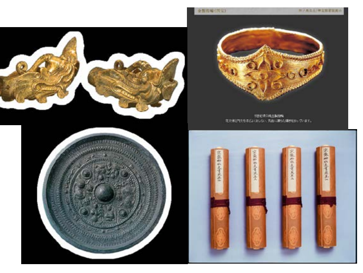
Munakata Taisha: National treasure