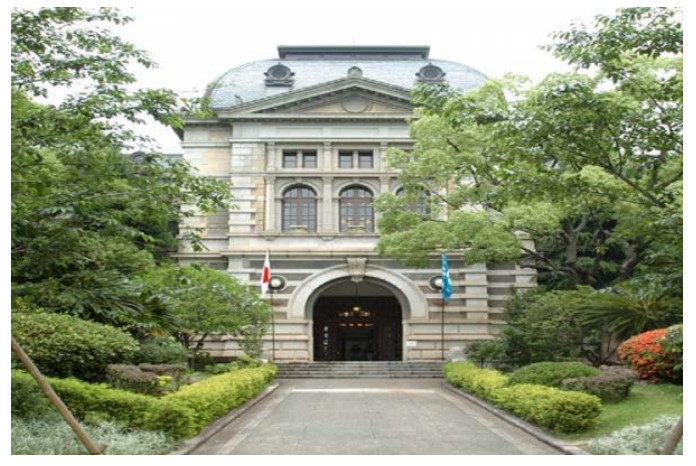
Hyogo Prefecture Guest House