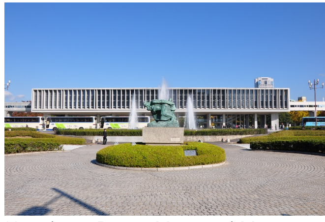
Hiroshima Peace Memorial Museum