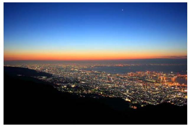
Night view of Kobe, form Mt. Rokkou