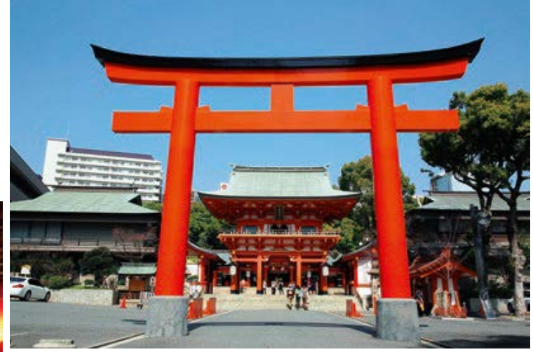
Ikuta Shrine Hall