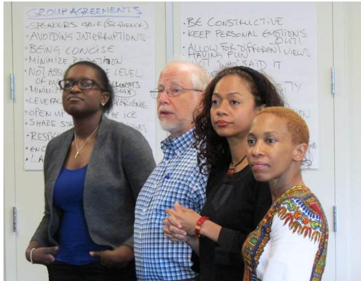
Leadership Training Program 2014