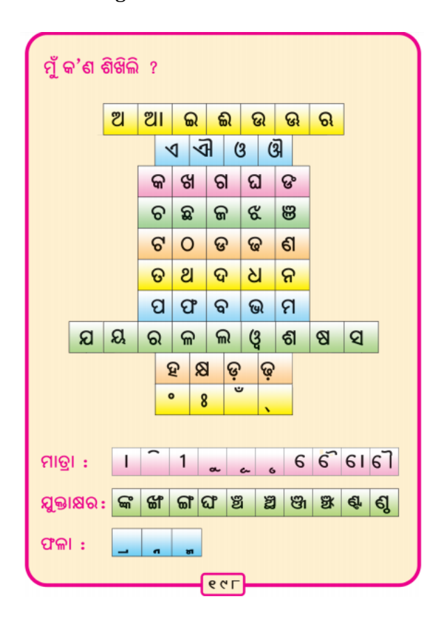
Figure 4: Odisha State Govt. Primary School Grade 1 e-book (Page 112)

Odisha State Government Primary School Grade 1 e-book "HasaKhela" [105] page 112 lists all the Oriya characters as shown in Figure 4.