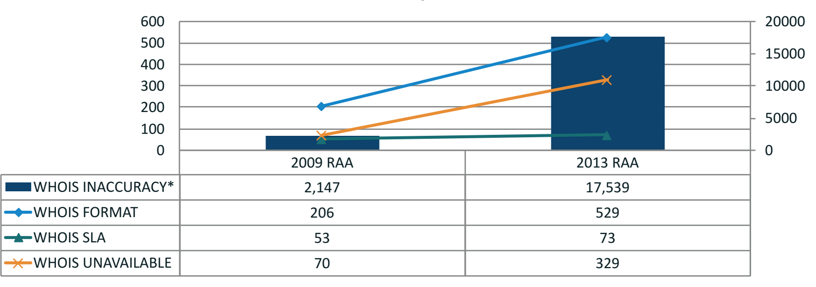
Feb 2016 – Sep 2016

* Includes Whois Inaccuracy, Whois QR & Whois ARS