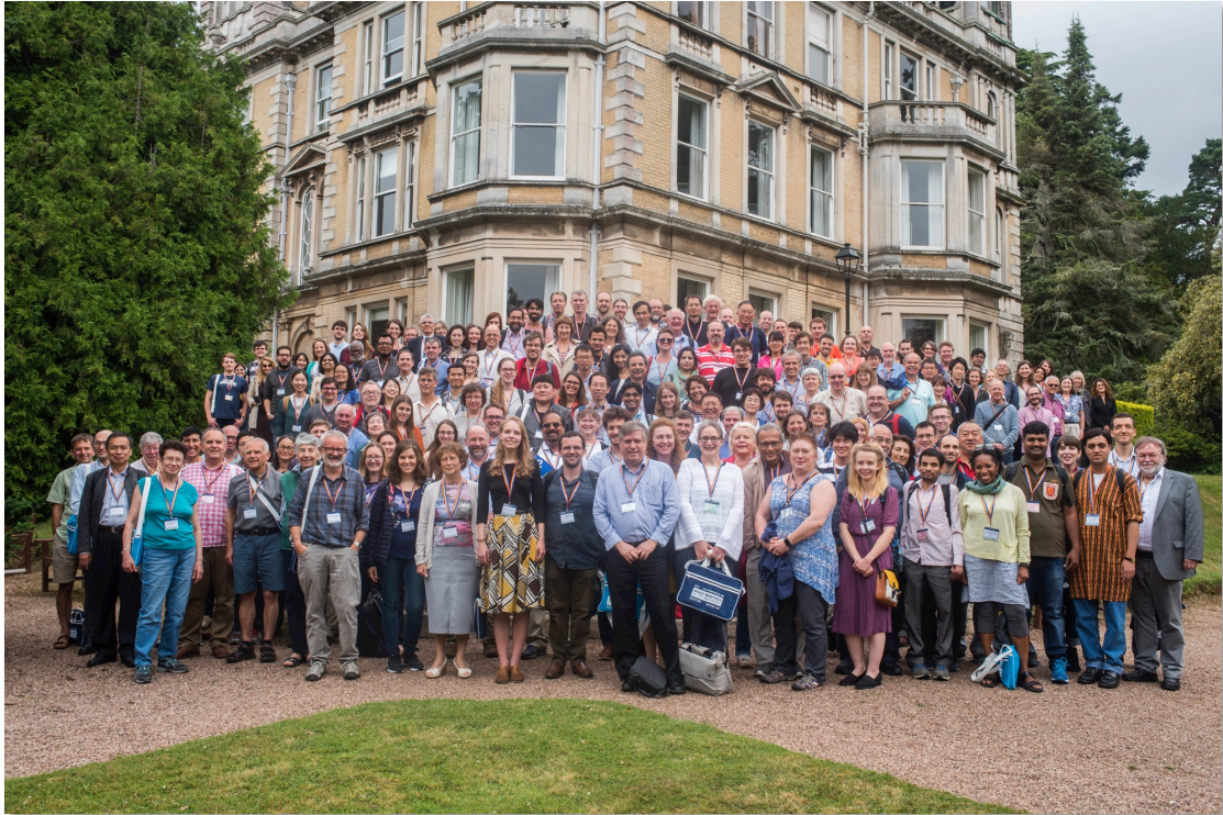
Symposium photograph taken on 19 th July 2017.