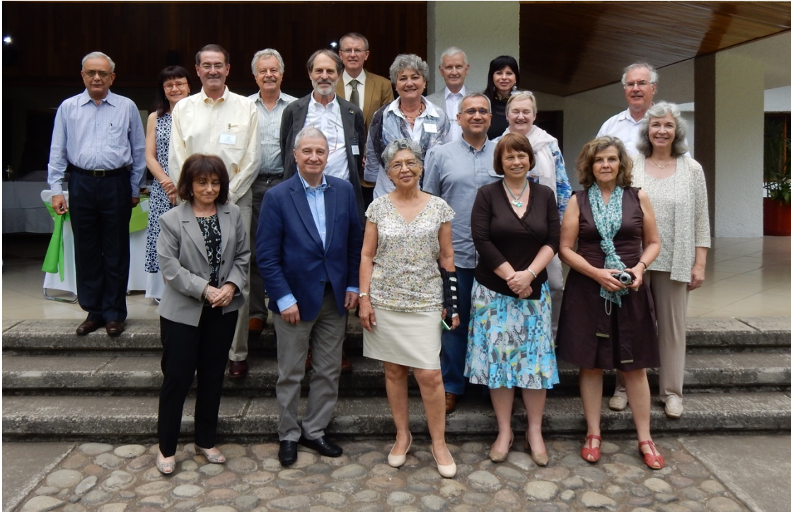
IAU EC Members and Division Presidents at the EC98 Meeting in Mexico City

The 98 th Executive Committee Meeting of the IAU took place between 4 and 6 May 2016 in Mexico City. It was hosted by the UNAM (Universidad Nacional Autónoma de México) and was also attended by the Division Presidents. We present here an executive summary of the main items discussed and the decisions taken.