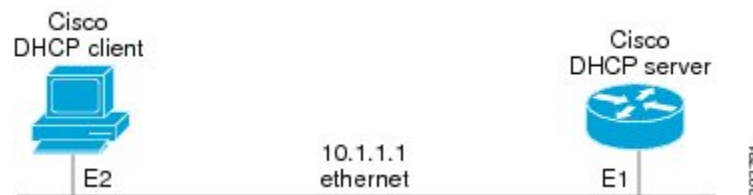
Figure 2: Topology Showing a DHCP Client with a Gigabit Ethernet Interface

On the DHCP server, the configuration is as follows: