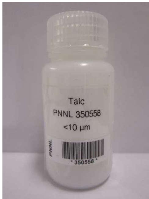
Figure 2: Talc in PNNL container (taken from 243604 Sigma-Aldrich bottle).