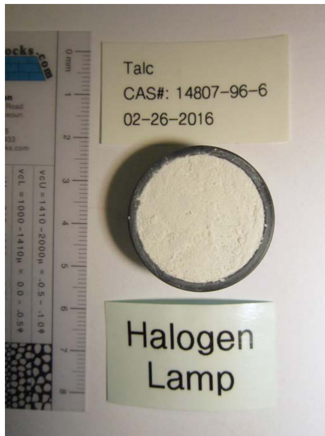
Figure 3: Talc sample loaded in IR sample cup.