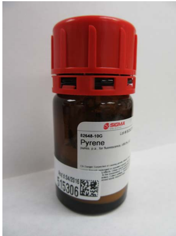
Figure 2: Pyrene in Sigma container.