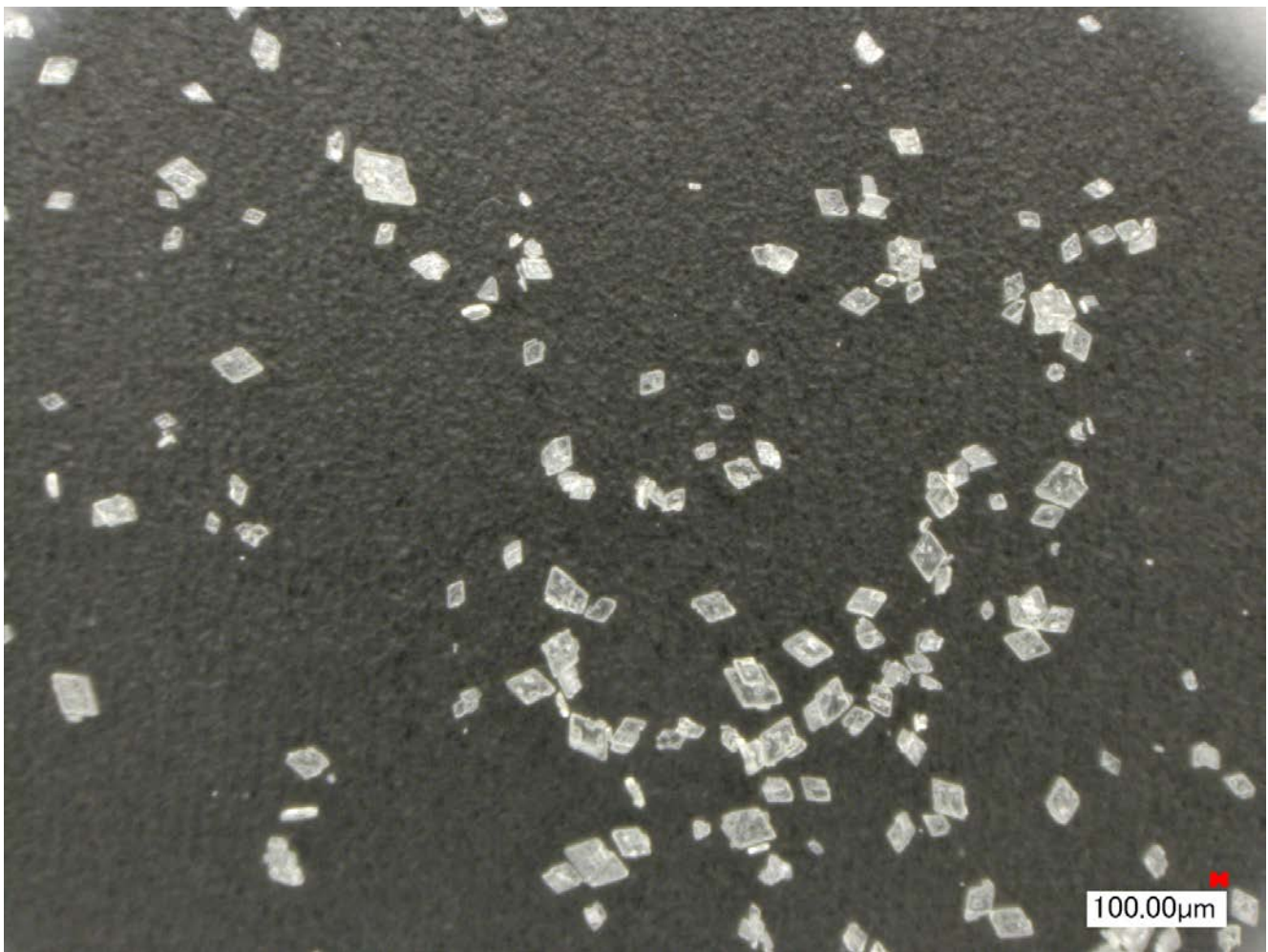
Figure 4: Photomicrograph of Pyrene.

A Keyence VHX-1000 digital microscope with 16-bit resolution is used to provide photomicrographs of the various samples and particle sizes. Software included with the microscope differentiates the brightness and colors in the image and extracts the bright objects to produce a binary image. The software assumes all adjacent bright points are part of the same object then calculates the area for each of these objects. The area (A) is used to calculate the mean particle diameter (d) by assuming the particles are spherical and using the relationship d = \sqrt{4A/\pi} . Although the assumption of spherical particles is clearly not always valid, this procedure provides a reasonable estimate of the mean particle size.