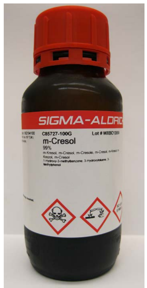
Figure 2: m-Cresol in Sigma-Aldrich container.