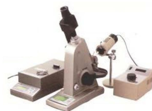
Figure 1: The Bruker Tensor 27 FTIR (a) and Abbe refractometer (b).