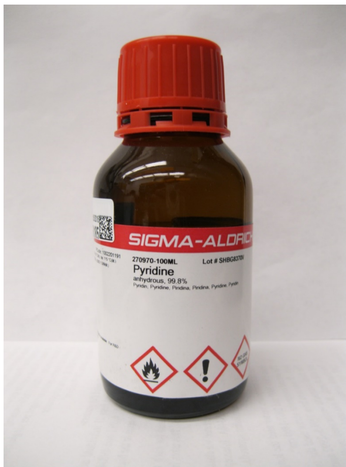
Figure 2: Pyridine in Sigma-Aldrich container.