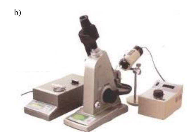
Figure 1: The Bruker Tensor 27 FTIR (a) and Abbe refractometer (b).