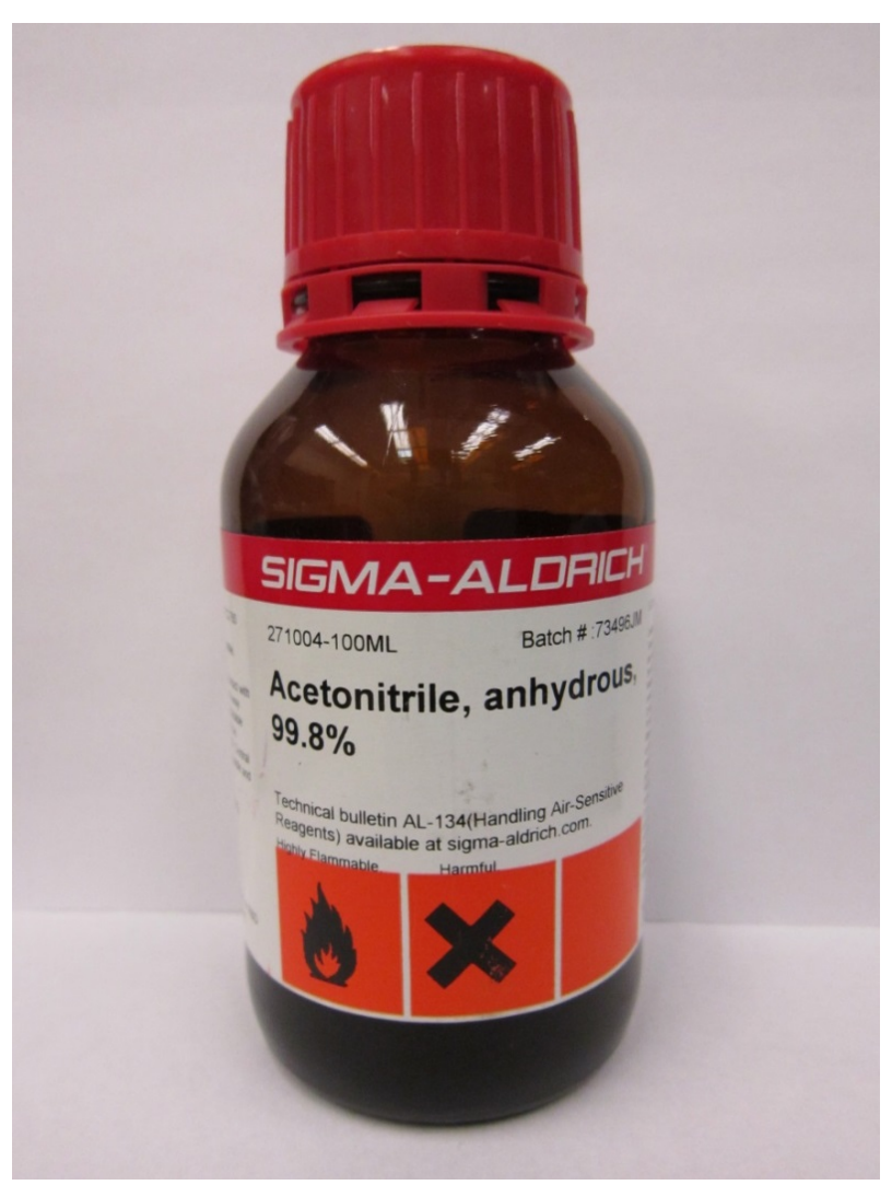
Figure 2: Acetonitrile in Sigma-Aldrich container.