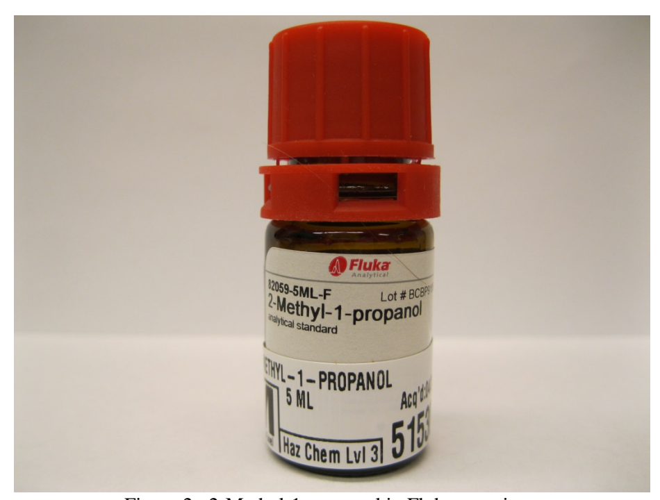
Figure 2: 2-Methyl-1-propanol in Fluka container.