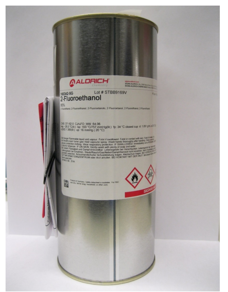
Figure 2: 2-Fluoroethanol in Aldrich container.