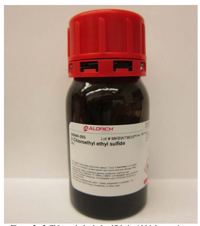
Figure 2: 2-Chloroethyl ethyl sulfide in Aldrich container.