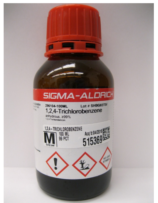
Figure 2: 1,2,4-Trichlorobenzene in Sigma-Aldrich container.