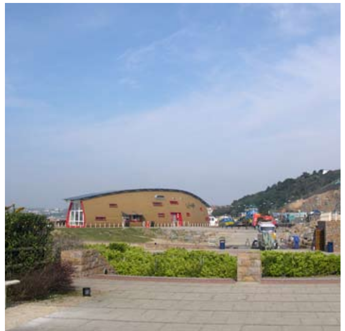
St Helier waterfront: disconnection issues

With the exception of the new apartments at Albert Pier – which add some much-needed life and activity - the first phase of waterfront development has been a sad disappointment . Above all, it looks desperately dated and there is no sense that St Helier has learned the lessons from best practice waterfront developments in the UK and the rest of Europe.