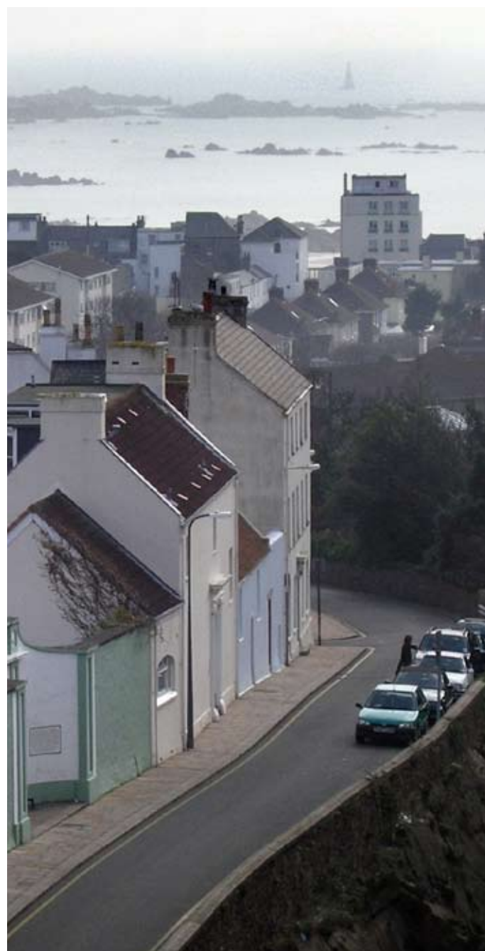
Havre-des-Pas from Fort Regent