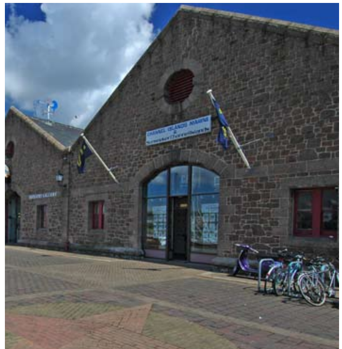
above: Maritime Museum below: King Street