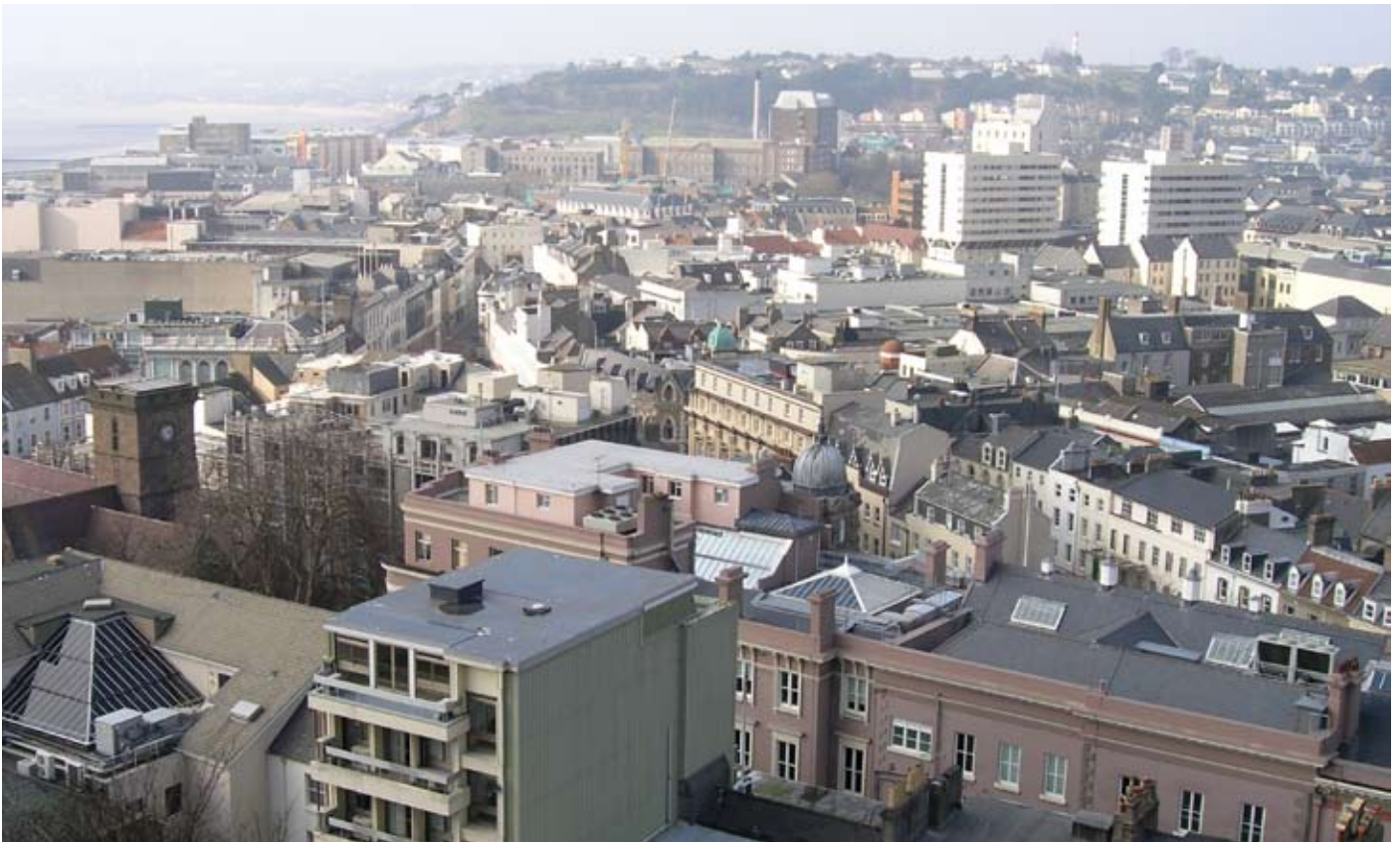
St Helier: west end from Fort Regent

These unique conditions are confirmed by St Helier's role as the seat of island government and administration, its entrepot function for the Channel Islands and its role as a centre for culture, sport and learning. Taken together, these factors help to explain why – despite a number of shortcomings – St Helier has the urban presence, vitality and choice of a much larger city.