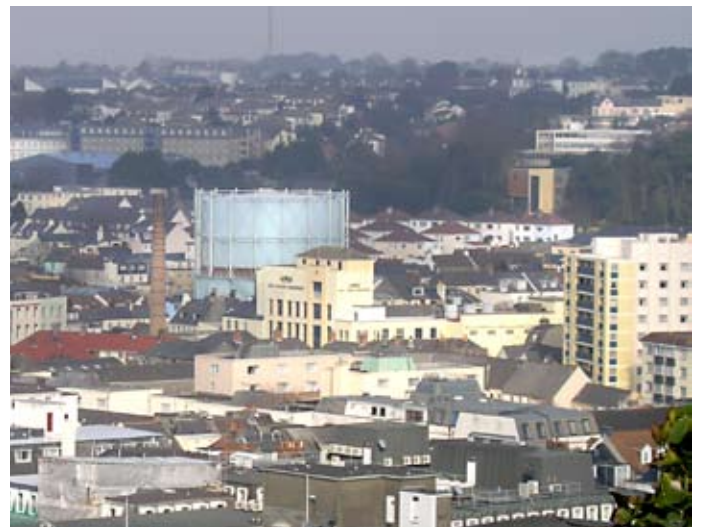
above: St Helier north east from Fort Regent below: Ariadne - the Steam Clock

Historically, there has been little evidence of an appetite for urban living , but there is little doubt that the growth of the owner-occupied sector would be beneficial at a number of levels. It would help to relieve development pressure on the island, create a better-balanced and more sustainable community, strengthen the retail and personal services sector and promote a more active and stimulating cultural scene.