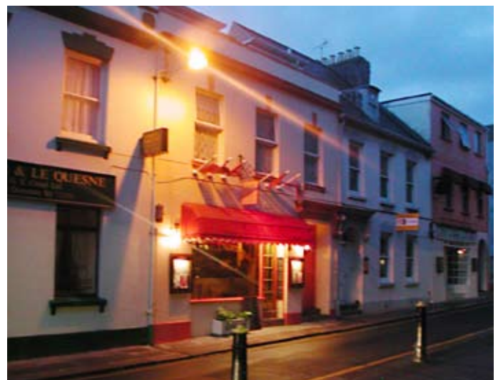
St Helier at night above: west end restaurant below: Weighbridge area

These observations are not criticisms. These factors reflect the special conditions and circumstances of the island, and they are not within the scope of this study. However, they need to be taken into account when future strategies for St Helier are being framed because, for example, they militate against bohemian lifestyle or the development of the creative industries both of which thrive on diversity, mobility and a large student population.