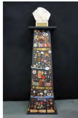
A small selection of the thousands of pins given out to factory workers, students, and others during ceremonies in the GDR.