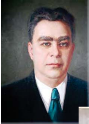
Portrait of Leonid Brezhnev Oil on Canvas, c. 1960 80 x 60cm

A cult of personality symbol of the communist regime, this print of Leonid Brezhnev's (Head of State, 1964 to 1982, USSR) portrait was used by German citizens in demonstrations immediately after the fall of the Berlin Wall.