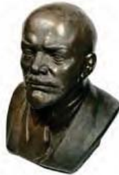
Bust of V. I. Lenin Plaster and Paint, c. 1960 Busts of V. I. Lenin, were mass-produced in the 1960's, painted to resemble bronze, and displayed throughout the GDR as a testament of loyalty to the teachings of Marx and Lenin, and the presumed fraternal ties with the Soviet Union.