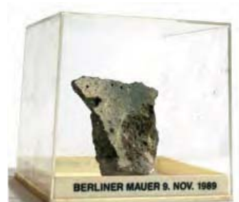
Berlin Wall Fragment