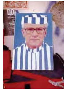
East German leader Erich Honecker in prison stripes.