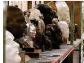
Collection of Busts, Wende Museum, Culver City, California

The centerpiece and symbolic center of the exhibit is, naturally, chunks of the Berlin Wall. Since its erection in 1961, the wall stood for ideological division between the communist east and the democratic west. The wall separated families and a formerly-united country. While the GDR leadership consistently defined the wall as an “anti-fascist” barrier to keep East Germans free from the unhealthy influences of the Federal Republic, western ideas and popular culture, West Germans and NATO allies saw the wall as a prison perimeter, forcing East Germans to unwillingly remain in their country. Several US presidents, most famously, John Kennedy in 1963 and Ronald Reagan in 1987 spoke to crowds in West Berlin, extolling the city’s grit and perseverance. Kennedy’s cry, “Ich bin ein Berliner,” and Reagan’s admonition to Gorbachev to “Tear down this wall,” served as iconic events in Berlin’s postwar history. 6 Given the half-century of serving as the symbolic epicenter of Cold War tensions, Berlin still resonates as a city between east and west. During the 2008 presidential campaign, the Democratic candidate, Barack Obama spoke and exclaimed: “This city of all cities knows the dream of freedom....People of the world looked at Berlin where a wall came down, a continent came together and history proved that there is no challenge too great for a world that stands as one.” 7