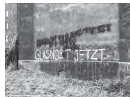
Graffiti spelling out “Openness now”

Meanwhile, the GDR government prepared for grand celebrations of its 40th birthday anniversary scheduled for October. Mikhail Gorbachev, the Russian leader who implemented the transformative policies of Glasnost (openness, governmental transparency) and Perestroika (governmental reform) in the Soviet Union in the mid-1980s, was to be the star attraction to congratulate the East Germans. His review of the massive parades planned for the ceremonies would provide the centerpiece and culmination of these celebratory events. But by October, when the commemoration festivities began, shouts of “Gorby,” “Gorby” in the manner of rock star groupies was seen by observers very differently. Gorbachev now represented a country which attempted reform.