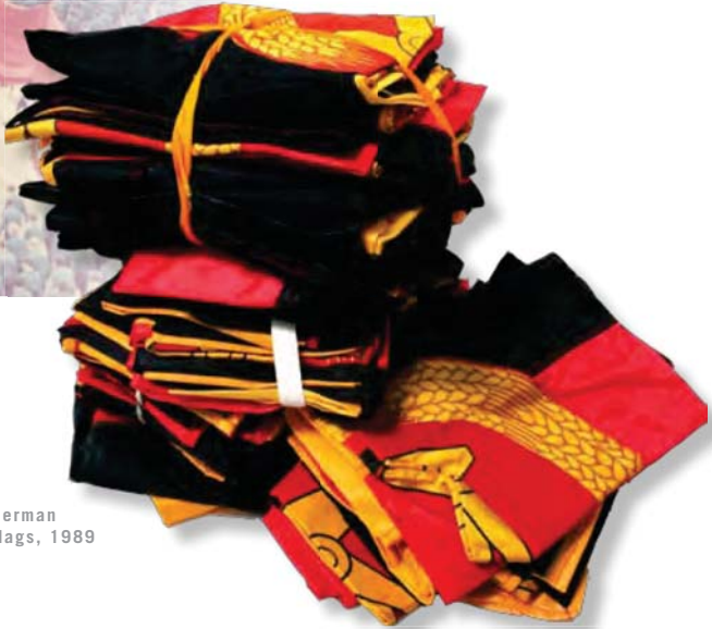
Unused East German banners and flags, 1989