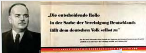
GDR-era election posters

Often election posters contained wordy exhortations, such as “The restoration of German unity is, above all, a concern of the German people, the east and west Germans.”