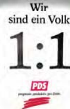
Election posters during the Wende emphasized freedom, unity and prosperity and condemned socialism.