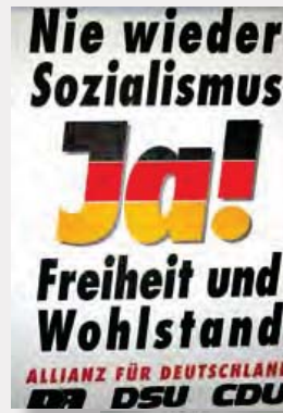
Election posters from the early 1990's