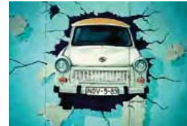
Image of the East German Trabant (“Trabi”) smashing through the Wall

Capitalists capitalized on selling off artifacts of the former country. These ranged from an oversupply of East German flags, manufactured to celebrate the 40th anniversary of the GDR in 1989, to a wide array of pins that were often given out at ceremonial occasions. Statues of leaders—such as the iconic founder of Leninism to portraits and posters of other Russians quickly disappeared from public view. Soon one could either find these objects, along with posters, paintings, household appliances, furniture and other detritus of the GDR in trash bins or for sale along the streets of central Berlin. In some cases, graffiti artists reworked posters, signs, and flags and transformed them into objects of satire or objects of consumption, such as soda bottles or t-shirts. This exhibition showcases a few of the literally thousands of material objects that have been salvaged and preserved by the Wende Museum in Los Angeles, the lender to this exhibition.