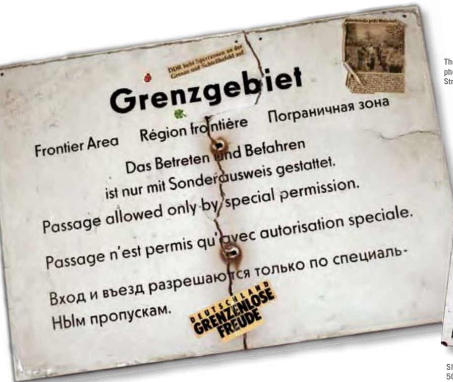
The GDR placed ominous sign warnings against trespassing and photography in a restricted zone at the Friedrich - Zimmer - Strasse / Checkpoint Charlie Border Crossing.