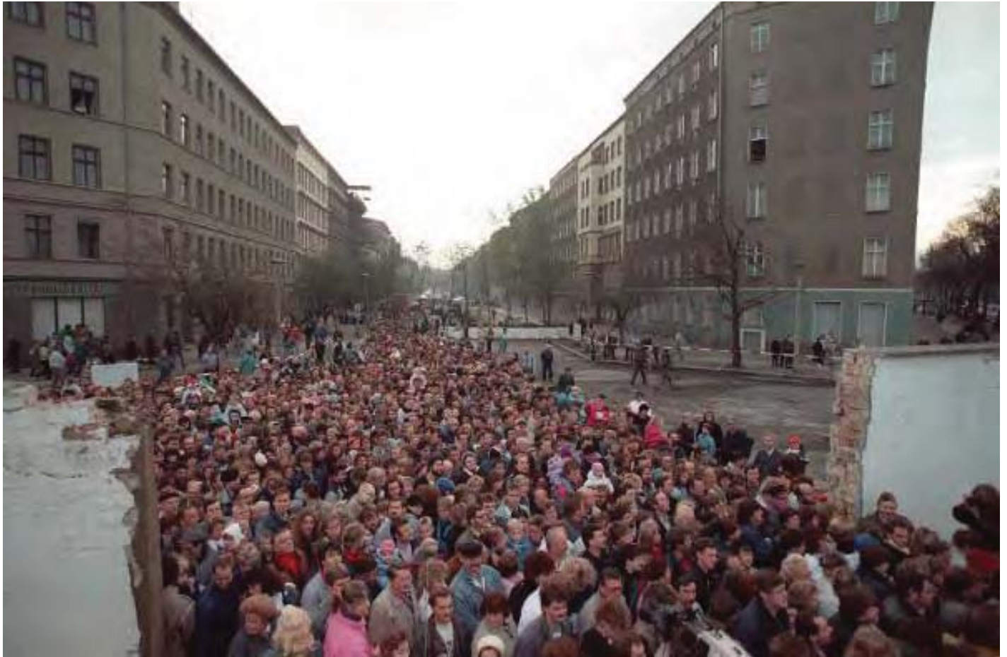
Checkpoint at Bernauerstrasse, November 12, 1989.