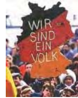
Demonstrations in the GDR

The East German population saw an opportunity to reform themselves along the lines of the USSR. However the GDR leadership, isolated and immune to criticism, saw little need to alter their authoritarian policies. Weekly street demonstrations in Berlin, Leipzig and Dresden by nascent opposition groups, such as the Protestant clergy, environmentalists, students, intellectuals and alternative parties, sprang up overnight during the months of September and October, accelerating the exit of the GDR hierarchy. By early November, the East German government scrambled to salvage their legitimacy by offering concessions to the protesters. One concession inadvertently and accidentally announced was a response to a reporter's question. A leading East German government spokesman, Günther Schabowski, announced a new regulation, immediately allowing GDR citizens to leave the country through any of the border crossings. While the easing of travel restrictions had been debated, no definite policy had been officially decided by the political leadership. Hence the reporter's question on November 9th literally brought down the wall. Shouts of "We are the people" to cries of "We are a united people" ( Wir sind das Volk, Wir sind ein Volk ) resonated among the East German population.