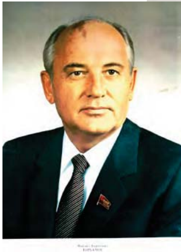
Portrait of Mikhail Gorbachev, 1987