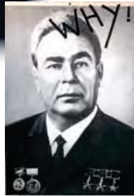
Portraits of Leonid Brezhnev Print on Paper, c. 1989 90 x 70 cm

A cult of personality symbol of the communist regime, this print of Leonid Brezhnev's (Head of State, 1964 to 1982, USSR) portrait was used by German citizens in demonstrations immediately after the fall of the Berlin Wall.