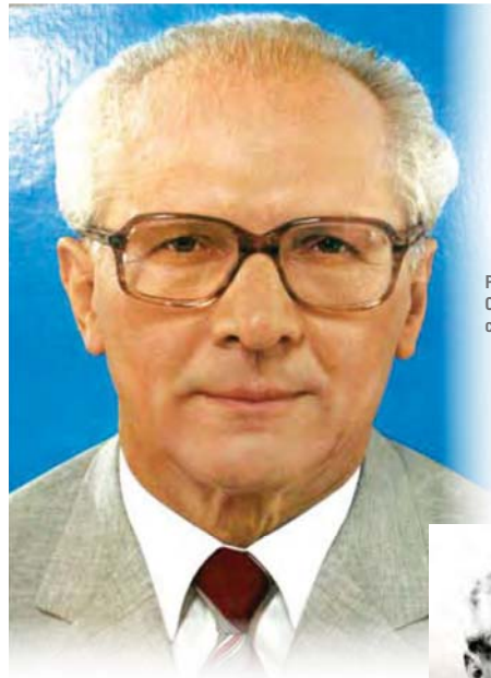
Portrait of Erich Honecker, Color Print on Canvas, c. 1980, 45 x 35 cm

The color portrait of Erich Honecker (Head of State 1971- 1989, GDR) would have hung in schools, shops and the office of functionaries across the GDR during his administration. After the fall of the Wall, and indicted in the death of over 180 East Germans, Honecker fled first to Moscow, then to Chile, and passed away at age 81 before having to stand trial.