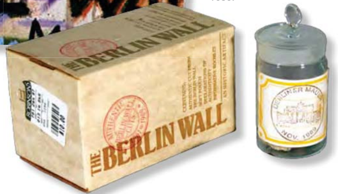
Robinsons-May Department Store Berlin Wall Souvenir, United States of America, 1989.