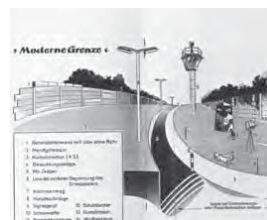
Wall with guard tower, surveillance cameras, and other monitoring equipment

Once the wall was breached on the night of November 9, 1989, it no longer remained the formidable and feared obstruction. Thousands of individuals flocked to it, chipping away at it and making off with pieces ranging from large to tiny souvenirs, sold as Christmas gifts in department stores. Several variations of these wall souvenirs are part of the exhibition.