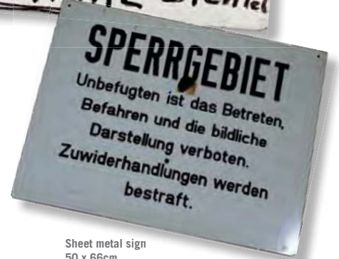
Sheet metal sign 50 x 66cm Front

In 1990 the GDR no longer exuded authority, and the reverse side of the sign (above) became a hand - lettered advertisement for souvenirs at the Wall ("Have your passports stamped with an authentic GDR stamp").