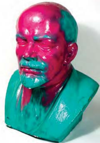
Bust of V. I. Lenin Plaster and Paint, c. 1960, November 1989 Originally identical to the one above it, this bust was altered with West German paint during a Leipzig Demonstration in October 1989 as the East German regime was collapsing.