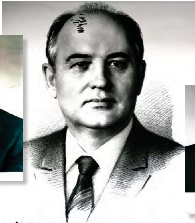
Portraits of Mikhail Gorbachev on sale, 1990