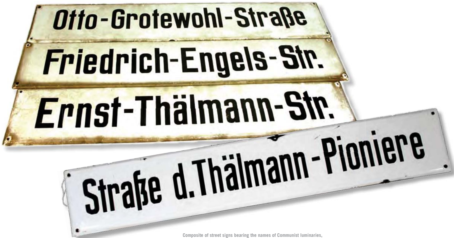
Composite of street signs bearing the names of Communist luminaries, such as Engels and Thaelmann along with East German leaders, such as Grotewohl. The streets were renamed after reunification. Metal alloy, c. 1970, 90 x 70 cm