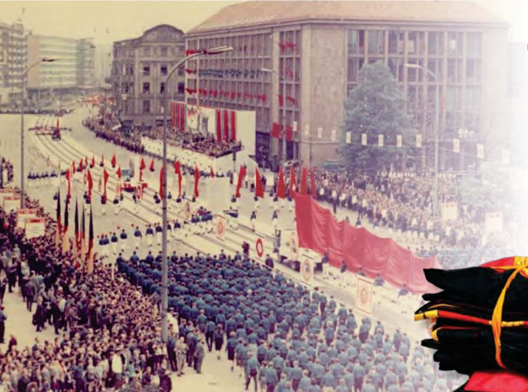
East German May Day Parade, c.1980