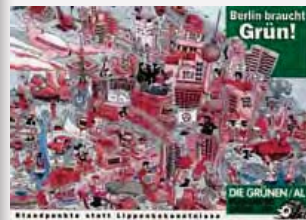
Contemporary German election posters

Recent posters continue to emphasize unity and freedom.