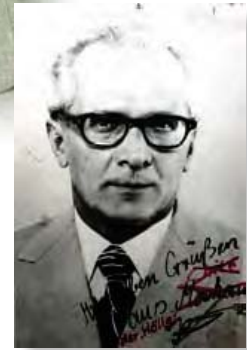
Portrait of Erich Honecker Print on Paper, c. 1989, 90 x 70 cm The pseudo-inscription sarcastically reflects this progression: " Fond Greetings from Moscow/Chile/Hell?".

The color portrait of Erich Honecker (Head of State 1971- 1989, GDR) would have hung in schools, shops and the office of functionaries across the GDR during his administration. After the fall of the Wall, and indicted in the death of over 180 East Germans, Honecker fled first to Moscow, then to Chile, and passed away at age 81 before having to stand trial.