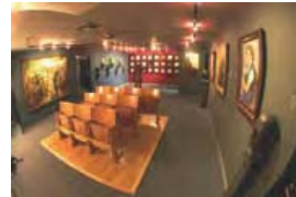
Gallery, Wende Museum, Culver City, California

In 2002, the Wende Museum was established in Culver City. Its founder and director, Justinian Jampol, has developed the important mission of collecting, preserving, and cataloguing the literally thousands of objects that the museum received from organizations and individuals in Europe and the former Soviet Union. 4 Why the museum is located in Los Angeles, rather than in Germany, another country in Eastern Europe or Russia is equally instructive. Some have suggested that the geographical and ideological distance halfway around the world means that interested visitors can examine the stored artifacts and learn about a period of history that had crucial importance globally. They can do so in surroundings relatively free from the debates still taking place in Germany about the history of the GDR and the role the building of the wall played both within East Germany and beyond. Additionally, there are still Central Europeans who remain unconvinced about the historic or cultural value of artifacts that exist in abundance in the eastern German states. Preserving these objects holds no interest to them—objects that the Wende Museum is in the process of cataloguing and archiving for present and future use.