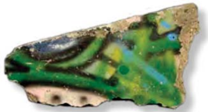
Berlin Wall Fragment

Walls are currently being built to separate the Palestinians from the Israelis, the Mexicans from the Americans, all in the name of economic, political, and social "peace." A question must be raised, however, when reviewing the history of the Berlin Wall. That question is: do people thrive when separated or when joined together? The Berlin of today is certainly a better, more economically viable, culturally attractive capital of one Germany than it was as a divided city separated by concrete slabs. And a united Germany embedded within the European Union is undoubtedly a more vibrant nation than when East and West Germany served as literal and symbolic flashpoints of the Cold War. Hence the exhibit can serve as a cautionary tale of how quickly seemingly impregnable barriers can crumble and change the course of history. The exhibit can also alert us to the way what once were icons of history—portraits, sculpture, banners and flags promoting values held critical, if not sacred by its nation's leadership—can, through satire, humor and the human spirit, demonstrate that the one overarching historical given is change and transformation.