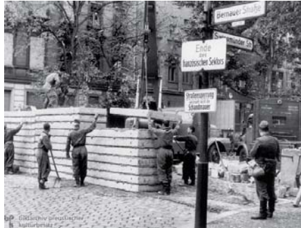
Fortification of Stone Wall, July 1963.