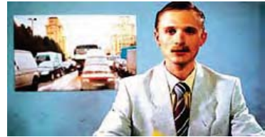
Scene from the 2003 film, Goodbye Lenin.

While a certain amount of what the Germans call Ostalgie , or nostalgic remembrance of life during the GDR regime has surfaced since unification, irreverence towards the East German legacy remains. This can be seen in the manner in which images and objects have been transformed during the twenty years from their original intent as serious objects of veneration and respect to objects of consumption and satire. Even though a generation has passed since the Wall's demolition, Germans are still working through the myriad of implications of unification. Hence this exhibition attempts to contextualize how images are created but then can be manipulated and altered as the political, economic, social and cultural environment wherein they were first created change over time. Within the exhibition space of the Goethe-Institut, we have tried to show these transformations and have offered a variety of objects—from political party posters and portraits to flags, street signs, party pins, and as fragments of the Berlin Wall itself—as documents of dizzying historical change.