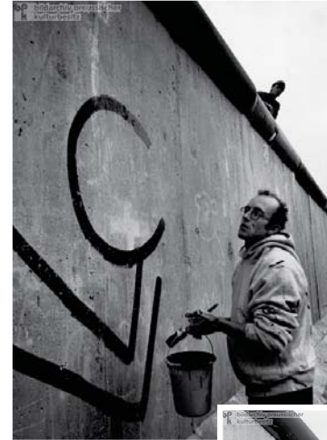
American artist Keith Haring painting on the Berlin Wall, 1986, with East German Guards photographing the scene.