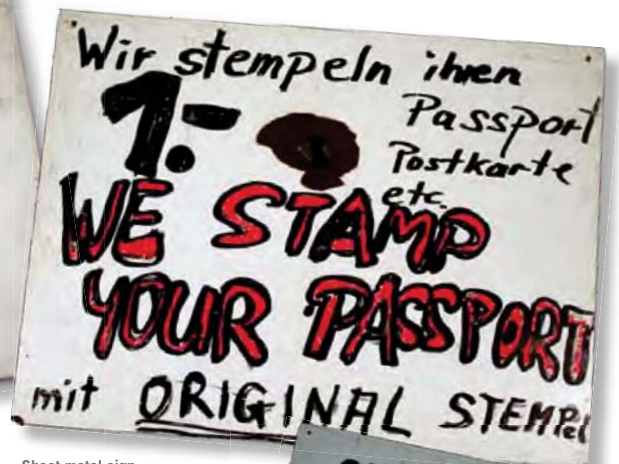
Sheet metal sign 50 x 66cm Back

In 1990 the GDR no longer exuded authority, and the reverse side of the sign (above) became a hand - lettered advertisement for souvenirs at the Wall ("Have your passports stamped with an authentic GDR stamp").