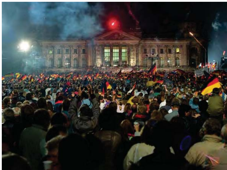
Celebrations at the Wall in front of the Reichstag. The photo was taken on Oct. 3, 1990, the first Day of German Unity.