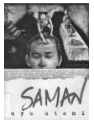
Saman by Ayu Utami

In 1998, literary circles in Indonesia were surprised by the publication of a novel written by a young woman called Ayu Utami. Her novel, Saman , was one of the contenders in a novel-writing competition held by Jakarta Arts Council. With-