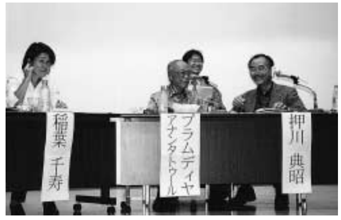
Pramoedya Ananta Toer delivering a public lecture in Tokyo, Japan in 2000