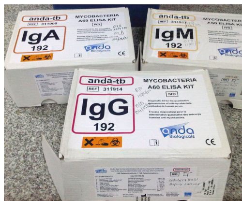
Figure 3 | Dozens of serological antibody tests for TB are available on the Indian market, although no international guideline recommends their use. The World Health Organization has recently published a policy recommending against their use.

A beginning has been made in this direction with the National Rural Health Mission (NRHM), launched by the Government of India in 2005, and with the newly proposed National Urban Health Mission. The result of the renewed focus on TB as well as on the functioning of health services can yield enormous dividends. A recent study from south India indicated preferential utilization in favor of government facilities for TB diagnosis and treatment, which is a hopeful sign (48). The success of both the general health services and the TB programme are dependent on one another and with a renewed focus on both, a truly win-win situation for both TB control and public health is possible.