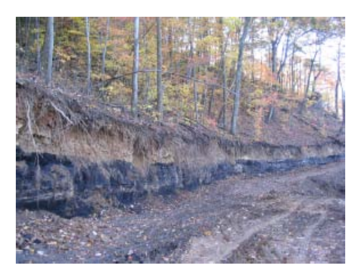
Figure 2. Coal bed in southwestern Virginia.

Coal occurs in Virginia in three widely separated areas, encompassing approximately 2,000 square miles of surface area: the Eastern Coalfields (Mesozoic basin fields such as the Richmond and