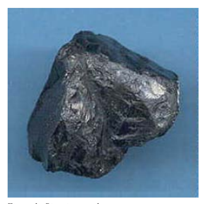
Figure 1. Bituminus coal.

Coal originated from ancient plants that flourished in swamp-like environments millions of years ago. In Virginia, coal was formed mainly during the Carboniferous Period of the Earth's history, 299 to 359 million years ago. There are also coal beds in Virginia that were formed during the Triassic Period, 201 to 250 million years ago. By comparison, most of the coals in the western United States were formed during the Cretaceous Period, 66 to 145 million years ago, and the Tertiary Period, 2.6 to 66 million years ago.