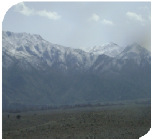
A view of some of the mountains we see on a daily basis.