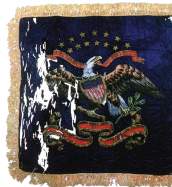
Cavalry Regimental flag, post-Civil War era

In 1891, Acting Secretary of War Lewis A. Grant renewed the idea of preparing a complete inventory of battles and skirmishes. This time the list was to be published in general orders rather than in the Army Register. (While the inventory was being prepared, the secretary instructed The Quartermaster General to issue colors and guidons without silver rings until the battle inventory was completed.) The list was submitted to the Secretary of War for publication in 1893, but he did not approve the compilation. Questions such as what should be considered a "battle" and what part of a regiment, battery or troop must have been engaged in order to be entitled to credit were unsettled. In 1900 and 1902 the 2d and 27th Infantry were informed that the list