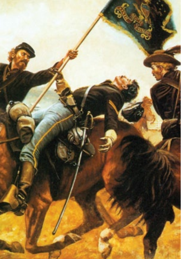
6th Cavalry regimental standard in the Battle of Gettysburg

battles and minor engagements and their dates. Evidently, the units never responded to the request, for no record has been found that any certificates were prepared. 26