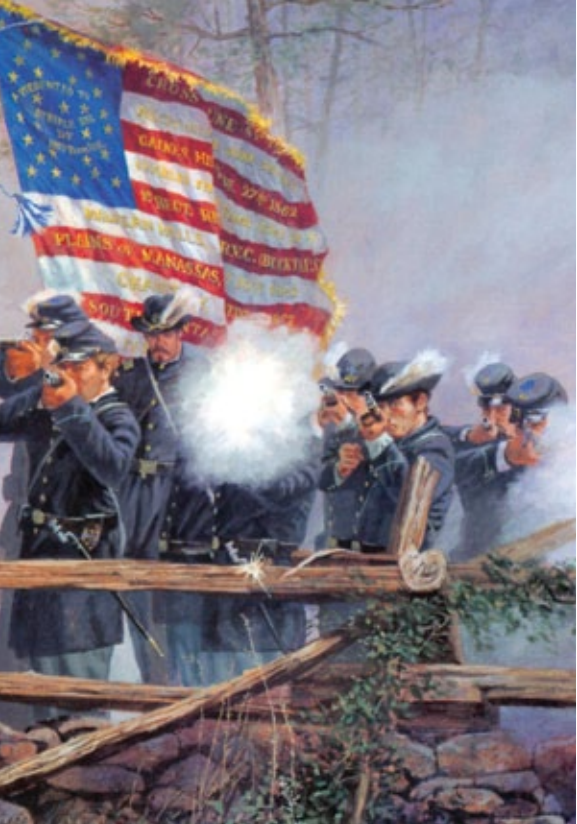
13th Pennsylvania Reserves flag with battle credits during the Civil War

of battles had not been completed; the following year the Office of The Adjutant General informed the 25th Infantry that the list had not been compiled and it was impracticable to make such a compilation at that time. In 1903 Francis B. Heitman, a former employee in the War Department, published the Historical Register and Dictionary of the United States Army. This unofficial work devoted more than 80 pages to listing the battles of the Army from 1775 to 1902. 20