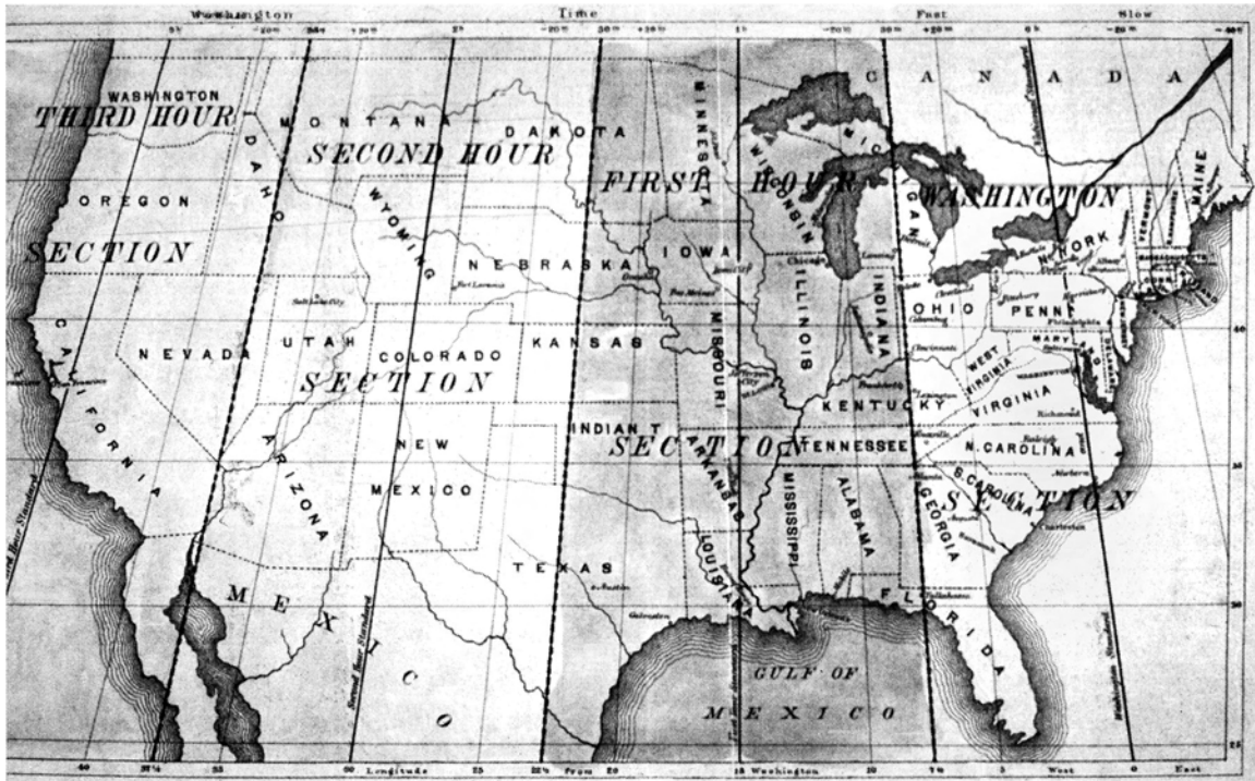
Figure 2. Dowd's 1870 map dividing the United States into four zones with precise longitudinal boundaries between the zones. The zones are indexed to the U.S. Naval Observatory's meridian in Washington D.C., not Greenwich, England. Sources: Dowd (1870) and Bartky (2000).