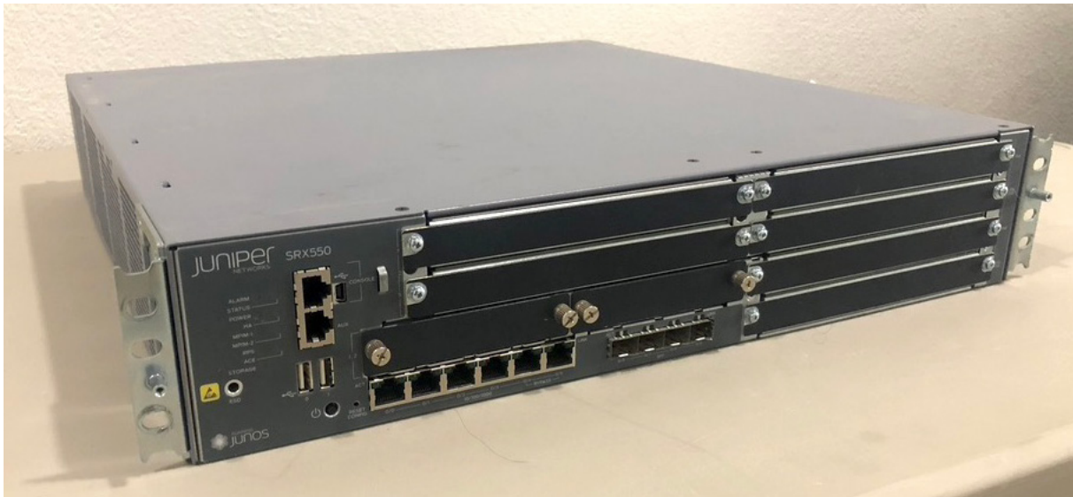
Figure 2. A Juniper SRX550 router

Of these 18 core routers, and despite them all being advertised as fully functional, one was dead on arrival (when powered on, the fan spun up but there were no indicator lights and no accessible console). As we initially had decided not to make any heroic efforts, such as data recovery or forensic investigation, we have eliminated this device from our remaining results, although perhaps simply replacing its power supply might have rendered it bootable, and if so, it seems likely that would have resulted in the configuration data – which was present when the device “died” – becoming accessible.