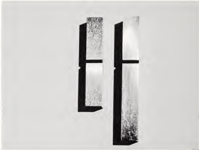
Figure 1. Photograph comparing a Charpy specimen (left) and Izod specimen (right).

NIST offers Charpy impact specimens in a variety of energies (from near 15 J to 200 J) that are designed to span the capacity range of most impact machines. For the initial evaluation of Izod machines, we decided to start with a single energy range, and selected the material used in the low-energy range for Charpy machines (SRM 2092). The material is heat treated to the highest strength, so it has a high resistance to fracture but for only a short period of time (Ref. [2]), which produces a fairly low absorbed energy value, near 15 J on a Charpy machine. As the force must be counterbalanced by the machine, this sharp blow also translates to a quick shock load to the machine anvil and striker, an effective, yet simple evaluation of the quality of the machine and its mounts. However, the Izod test procedure requires aligning and clamping the specimen in an Izod vise (a relatively slow process), and so this necessitates testing at room temperature, instead of the -40\text{ }^{\circ}\text{C} temperature used for the SRM 2092 Charpy procedure. This upward shift in temperature was expected to raise the absorbed energy slightly, and is one example of the procedural changes that needed to be evaluated.