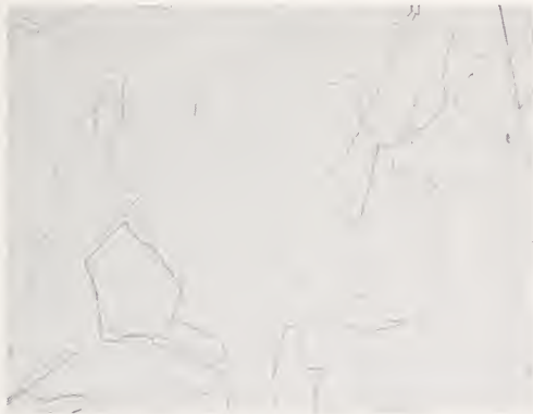
Figure 2a. Metallographically polished and etched surface of one disk specimen showing grain structure present. M = 160X.