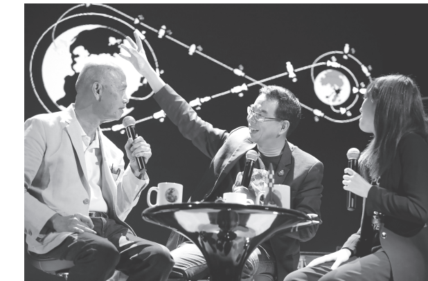
50 Years: First Man on the Moon, Thailand.

We offer a number of programmes to connect amateur astronomy groups with professional astronomers (e.g. Meet the IAU Astronomers!) and resources to enhance the outreach you may do with community groups (e.g., Telescopes for All). We encourage you to plan events around our IAU Annual Outreach Programmes, so your community members can be a part of a global event. You can also contact your IAU National Outreach Coordinator (NOC) for further support in your country.