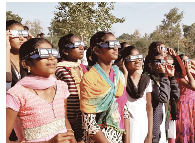
100 Hours of Astronomy, India.

Through the Meet the IAU Astronomers! programme, amateur astronomers, informal educators, and teachers can bring an IAU member astronomer into a meet-up to talk to students, parents, and the general public about astronomy, the importance of astronomy for society, and choosing astronomy as a career.