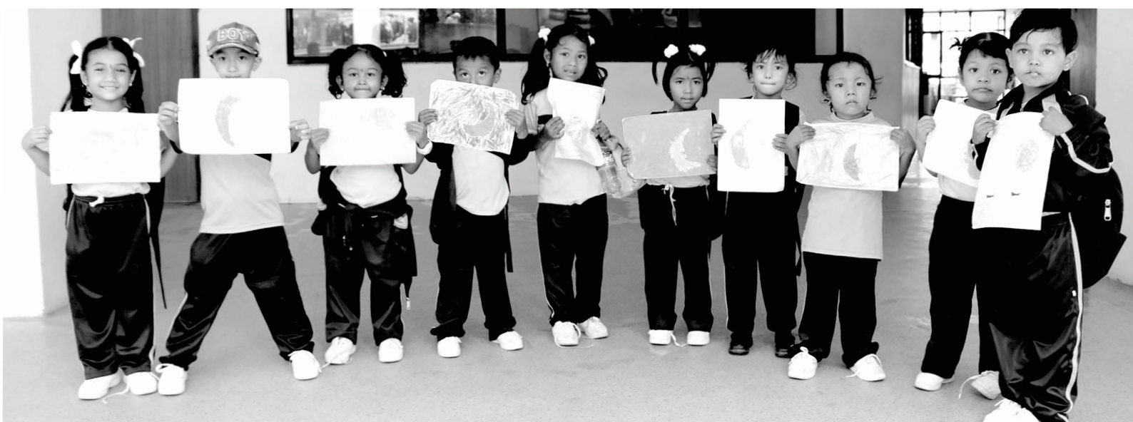
Nuit des étoiles – Tunisia.

The International Astronomical Union (IAU) is the largest international organisation of professional astronomers. The mission of the IAU is to promote and safeguard the science of astronomy in all its aspects (research, communication, education and development) through international cooperation.