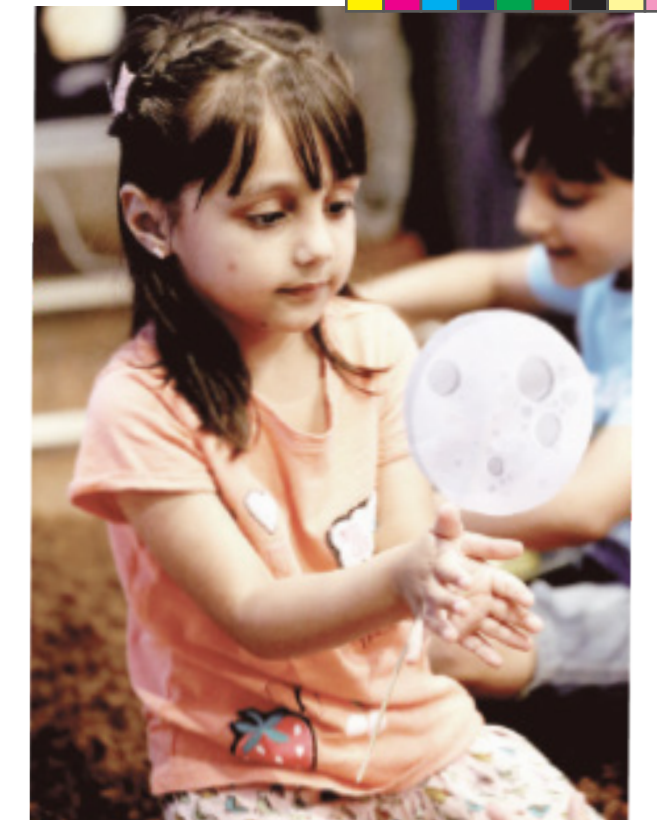
Space Art Workshop – Pakistan. Credit: Yumna Majeed