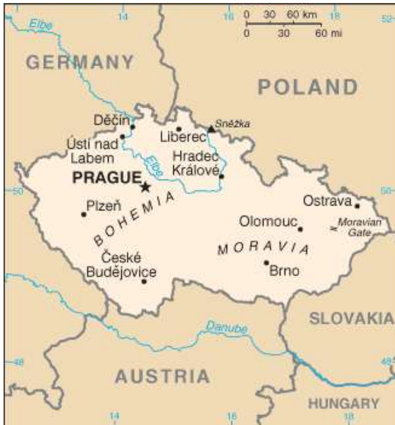
Figure 2 - Map of the Czech Republic