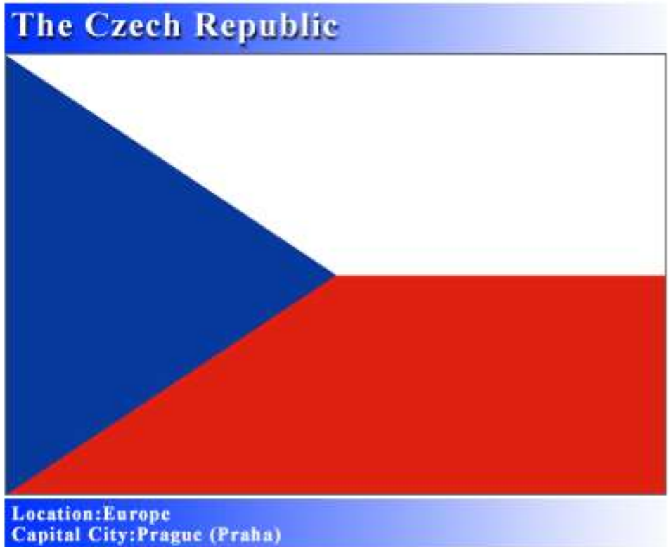
Figure 1 - Czech Republic Flag