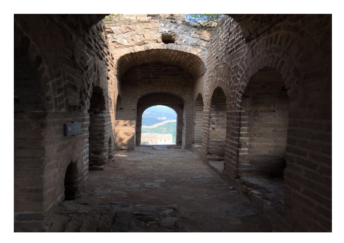
Your view is needed!