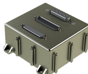
5.5 x 5.25 x 2.65"