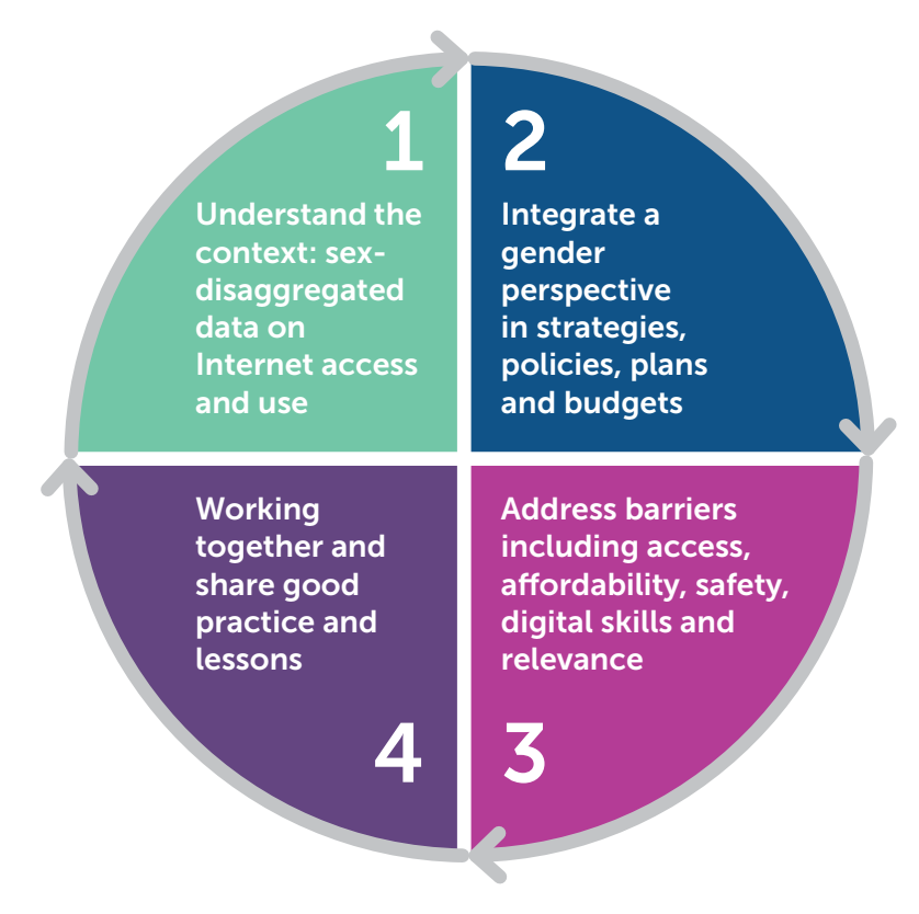
Figure 1: Recommendation areas

These groups are represented in Figure 1 below. Other barriers, including the limited presence of women in the technology sector (not least in positions of decision-making), are also important and need to be addressed, but fall outside the primary focus of this report.