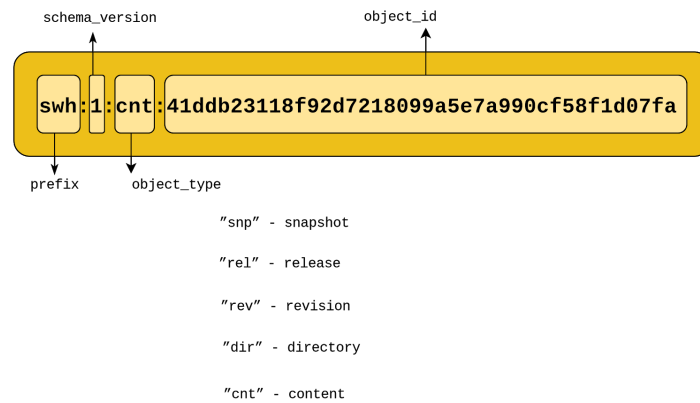
Figure 2: Schema of the core Software Heritage identifiers

Once the source code has been archived, the Software Heritage intrinsic identifiers , called SWHID, fully documented online and shown in Figure 2, can be used to reference with great ease any version of it.