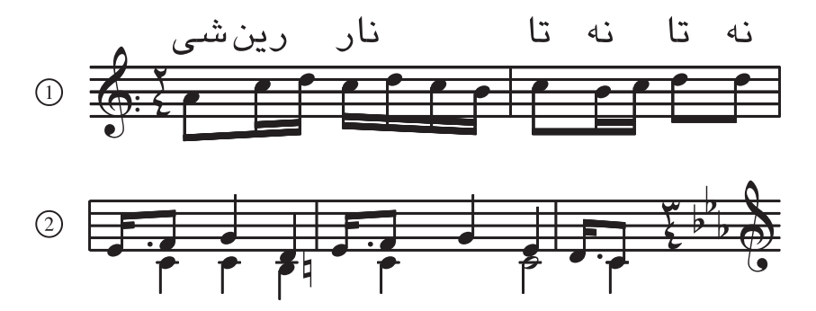
Figure 21-1. Examples of Specialized Music Layout

MUSICAL SYMBOL BEGIN BEAM and U+1D174 MUSICAL SYMBOL END BEAM can be used to indicate the extents of beam groupings. In some exceptional cases, beams are left unclosed on one end. This status can be indicated with a U+1D159 MUSICAL SYMBOL NULL NOTE-HEAD character if no stem is to appear at the end of the beam.