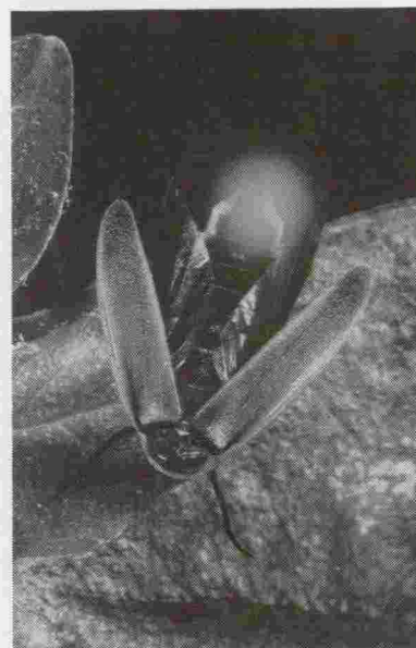
What makes a firefly glow?

But there are snags. The difficulties and dangers associated with even this routine medical use of radioactive iodine were sharply highlighted after the Chernobyl accident. Then, in order to find out just how much radiation from Chernobyl had fallen in the rain on Wales, researchers measured a 'control' sample from people and animals in Weybridge, where no radioactive rain had fallen. To their surprise, they found higher radiation levels in the Weybridge population — and traced this to radioactive iodine from hospitals, that had got into the Thames and on into drinking water.