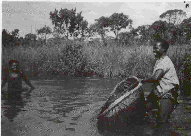
Women harvesting fish from one of the village ponds

Elizabeth's field-work to date has involved living among fish farming communities in two Lua-