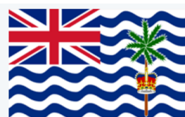
101domain.com Figure 6

Unlike some country code domains, .io domains are unrestricted meaning no weird requirements or documents needed. There are also no premium domain names so you can get any available name for an amazing price.