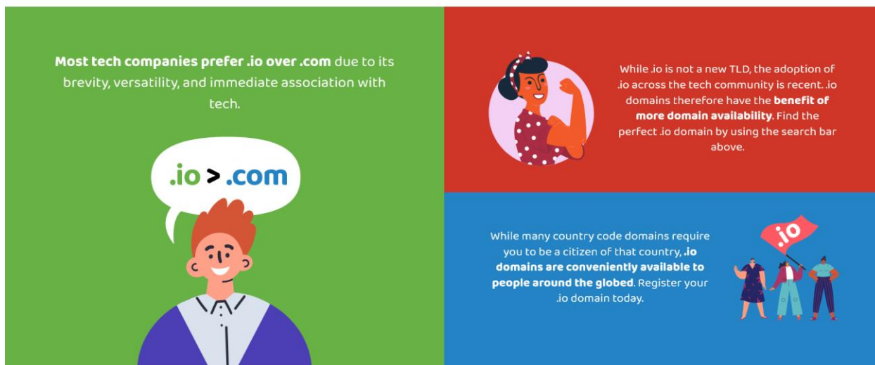
www.techdomains.io Figure 4

GRS also uses 101domain.com to market ccTLD .io to consumers as the domain for startups, open source, and APIs (application programming interfaces). (Figure 5) It touts the unrestricted nature of ccTLD .io and uses the BIOT indicia (flag). (Figure 6)