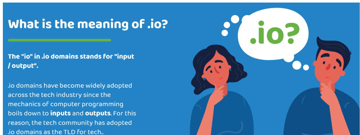
Techdomains.io Figure 3

Techdomains.io which is also controlled by GRS markets ccTLD .io domains direct to consumers. It also portrays ccTLD .io as desirable for "tech." due to being unrestricted and better than .com. Figures 3 and 4