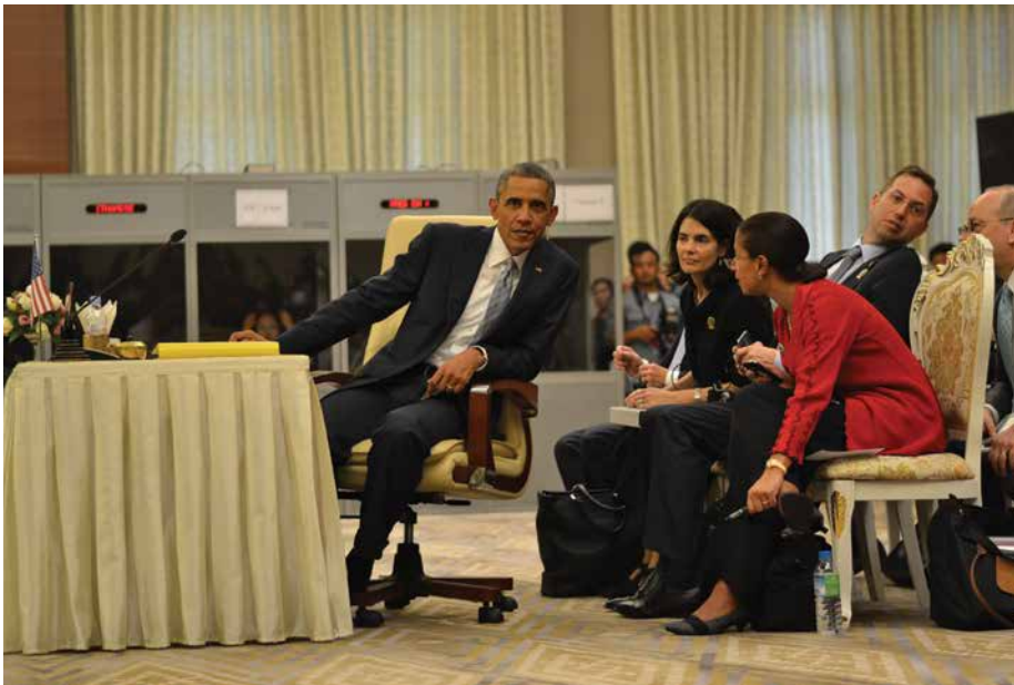
US President Barack Obama confers with National Security Adviser Susan Rice (red top), 9th East Asia Summit, Naypyitaw, Myanmar, 13 November 2014.