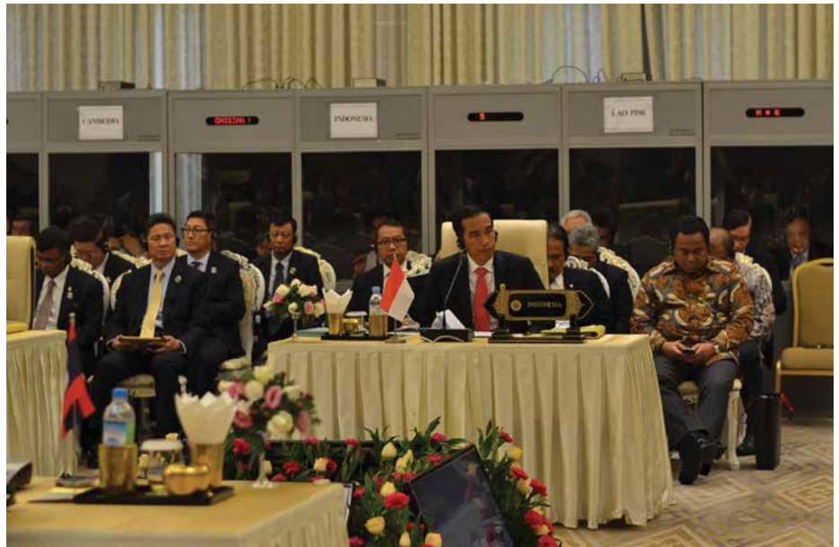
Indonesian President, Joko Widodo listens to China's Prime Minister Li Keqiang at the 25th ASEAN Summit, Naypyitaw, Myanmar, 13 November 2014.

From the time Indonesia declared independence in 1945, ideological fractures and regional disintegration within Indonesia's borders were seen as the biggest security threat to the state. Yet with the consolidation of democratisation, decentralisation and sustained economic growth, Indonesia has started to put the bogeys of separatism and ideological revolution to rest. While there is some unfinished business on the domestic security agenda—notably the conflict over the status and rights of Papuans and the risk of terrorism—neither of these constitute serious armed threat to the authority of the state. Yudhoyono left office on 20 October 2014, leaving Jakarta more sanguine about the durability of the nation building project than any time in its history. The consequence for security is that the Indonesian armed forces (Tentara