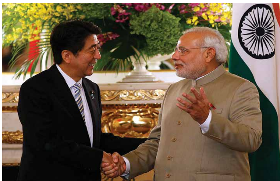
Prime Minister Abe meets Prime Minister Modi in Tokyo, October 2014.