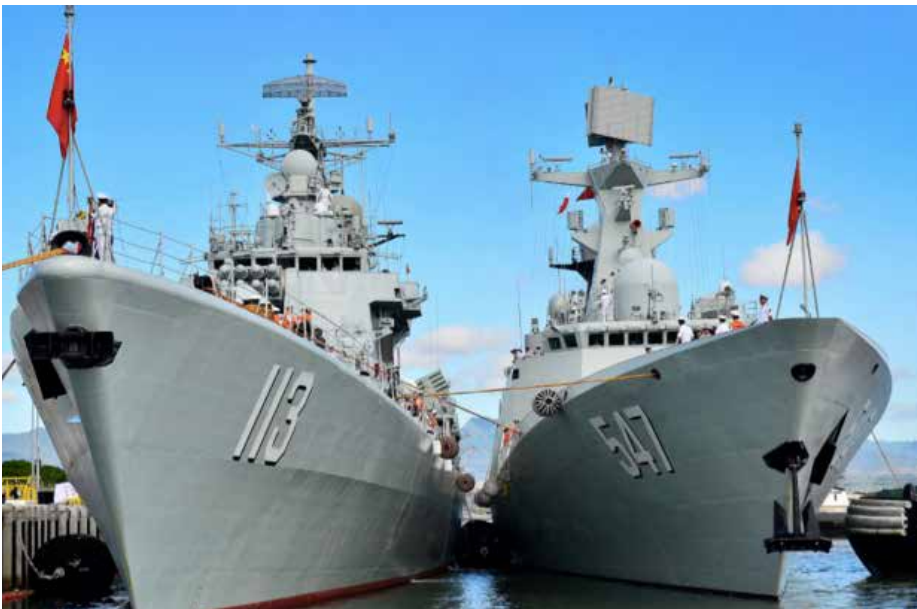
The Chinese People's Liberation Army-Navy Jiangkai-class frigate Linyi (FFG 547) moors alongside the Luh-class destroyer Qingdao (DDG 113) following the ships' arrival at Joint Base Pearl Harbor-Hickam, 6 September 2013.