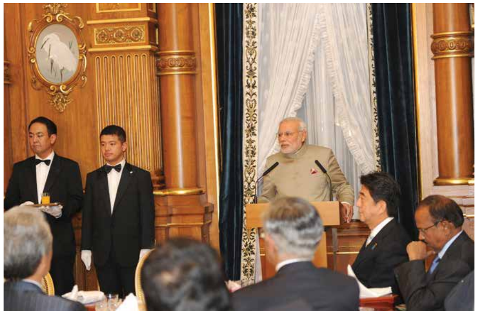
India's Prime Minister Narendra Modi at a banquet hosted by Japan's Prime Minister Shinzo Abe, at Akasaka Palace, Tokyo, Japan, 1 September 2014.

The responsibility to engineer the change in economic and foreign policy domains fell upon a series of weak coalition governments that were in charge of the nation from 1989. Although the change in India's economic and strategic orientation over the last quarter of a century has been palpable, it has also been incremental and been clouded by self-doubt. The depressing drift of the United Progressive Alliance (UPA) government, especially during its second term (2009 to 2014) revealed once again the persistent gap between India's strategic promise and performance. The election and appointment of Narendra Modi as prime minister in the summer of 2014 with a surprisingly large mandate has helped dispel some of the pessimism about India's