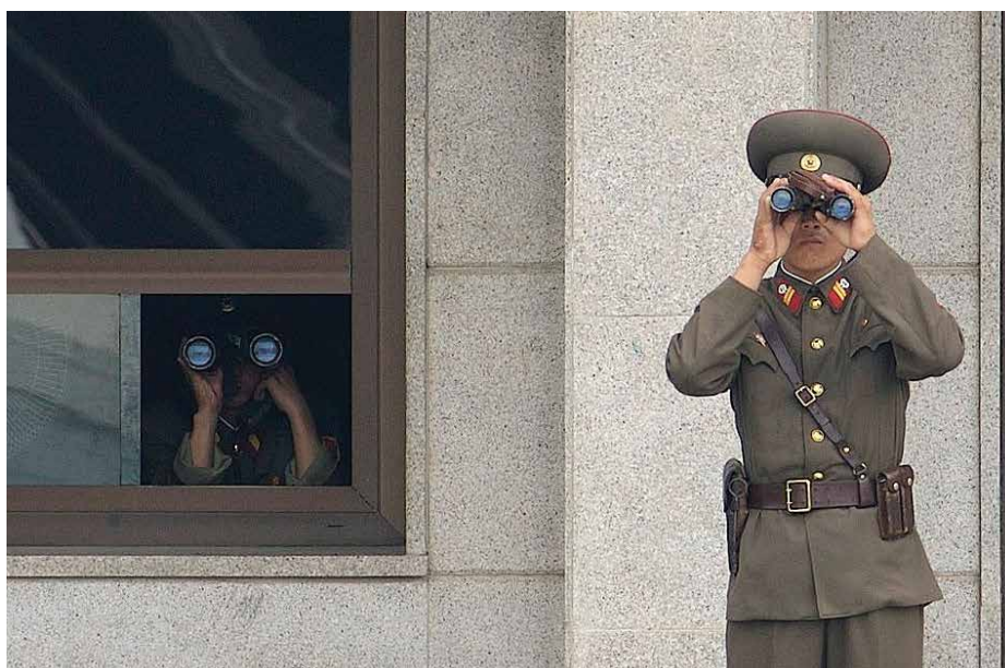
Soldiers from the Korean People's Army look south while on duty in the Joint Security Area.

From the first days of their separation after World War II, both North and South Korea have lived in a constant fear of invasion mixed with the constant desire to pre-empt this invasion by attacking first and unifying the country. The unfinished nature of the Korean War left both Pyongyang and Seoul frustrated and paranoid about each others' intentions, effectively precluding any improvement in bilateral relations to the present day. Suspicions that détente and