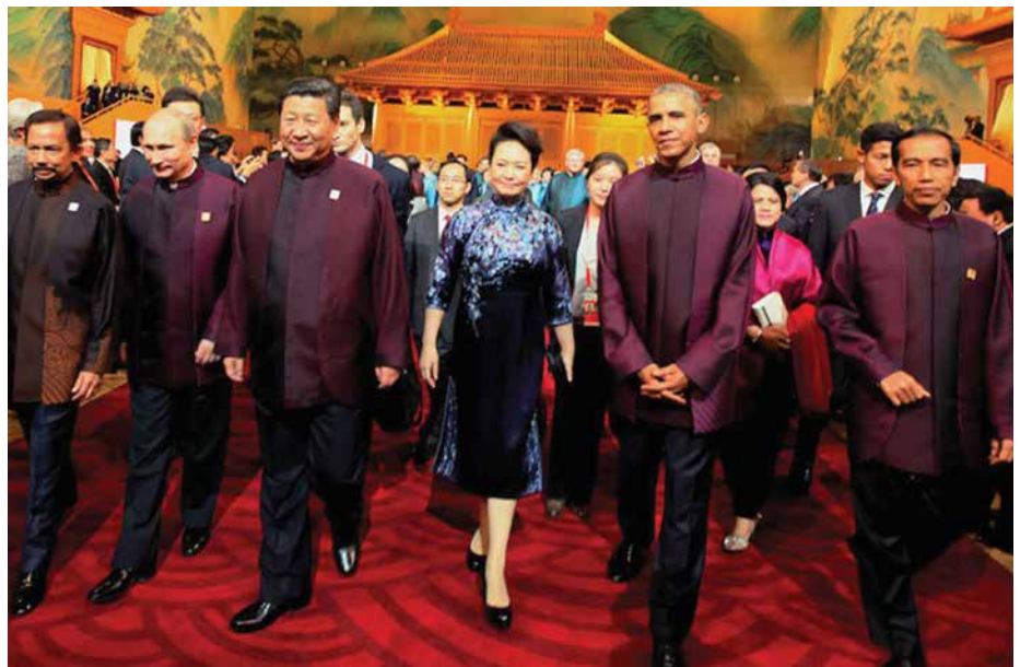
Indonesia's new President, Joko Widodo, (far right) steps out with other leaders at APEC, Beijing, November 2014.

Since its independence in 1945, Indonesia has faced an essentially unbroken series of internal security threats—ranging from terrorism, ethno-religious conflicts, to full-scale insurgencies. As such, an abiding concern for