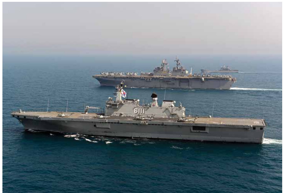
South Korean and US Amphibious Warfare Ships during bi-lateral exercise Ssang Song, April 2014.

Given that prevailing circumstances do not allow a China-centered East Asian order, China appears to be focused on maintaining a stable relationship with the United States with a view to continuing its economic growth. However, China is actively promoting regional cooperation by respecting ASEAN centrality and its leadership of the Regional Comprehensive Economic Partnership (RCEP) as a counter to the US-led Trans-Pacific Partnership (TPP).