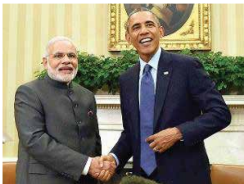
India's Prime Minister Narendra Modi with US President Barack Obama, Washington DC, October 2014.