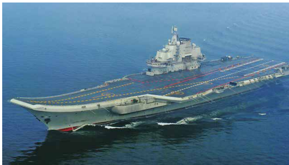
China's first aircraft carrier on sea trials.

It is commonly held in Washington that, if the United States is fully committed to Asia, then Washington and Beijing will be able to create long-term cooperative strategies that accommodate each other’s interests. Doing this would significantly reduce miscalculation and the likelihood of conflict. Beijing may not like the pivot, but the US government believes that China’s leaders—while disturbed by the long term strategic dimensions of the pivot—will eventually come to terms