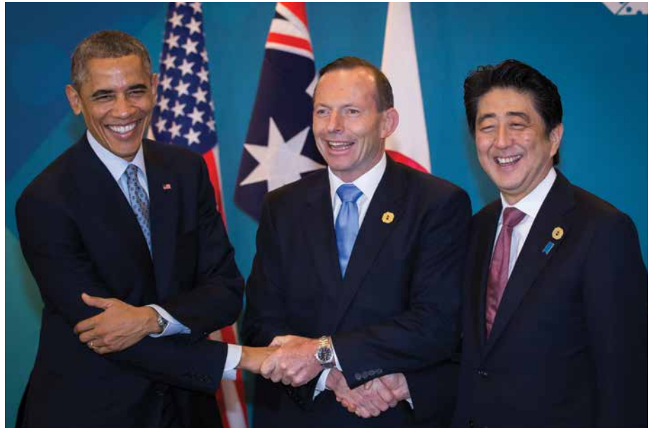
President Obama, Prime Minister Abbott and Prime Minister Abe following a tri-lateral summit held in the margins of the G20, Brisbane, November 2014.

All this constitutes the largest revolution in Asian strategic affairs in a very long time—certainly since Nixon met Mao in 1972, and quite possibly since the eclipse of China and the emergence of Japan as Asian great powers in the 19th Century. China is set to overtake the US as the world's largest economy, and it is quickly eroding America's capacity to project armed force by sea in the East Asian littoral. China's ambitions have