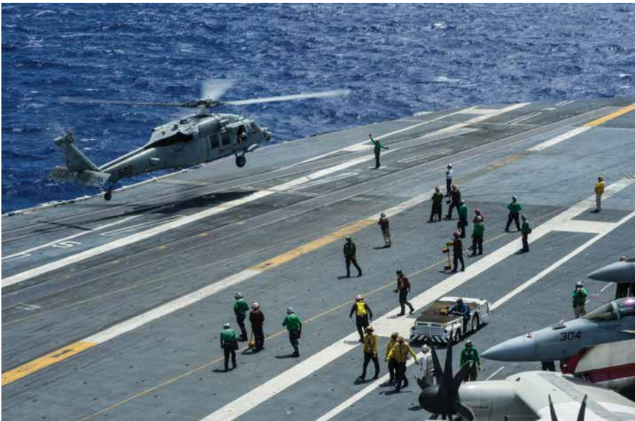
An MH-60S Sea Hawk helicopter from the Golden Falcons of Helicopter Sea Combat Squadron (HSC) 12 prepares to land on the flight deck of the US Navy's forward-deployed aircraft carrier USS George Washington on waters near Guam, 1 October 2014.