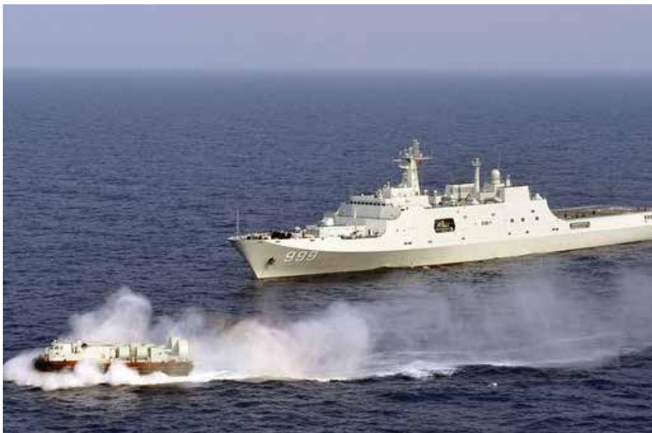
Chinese Navy drills, South China Sea, 27 March 2013.