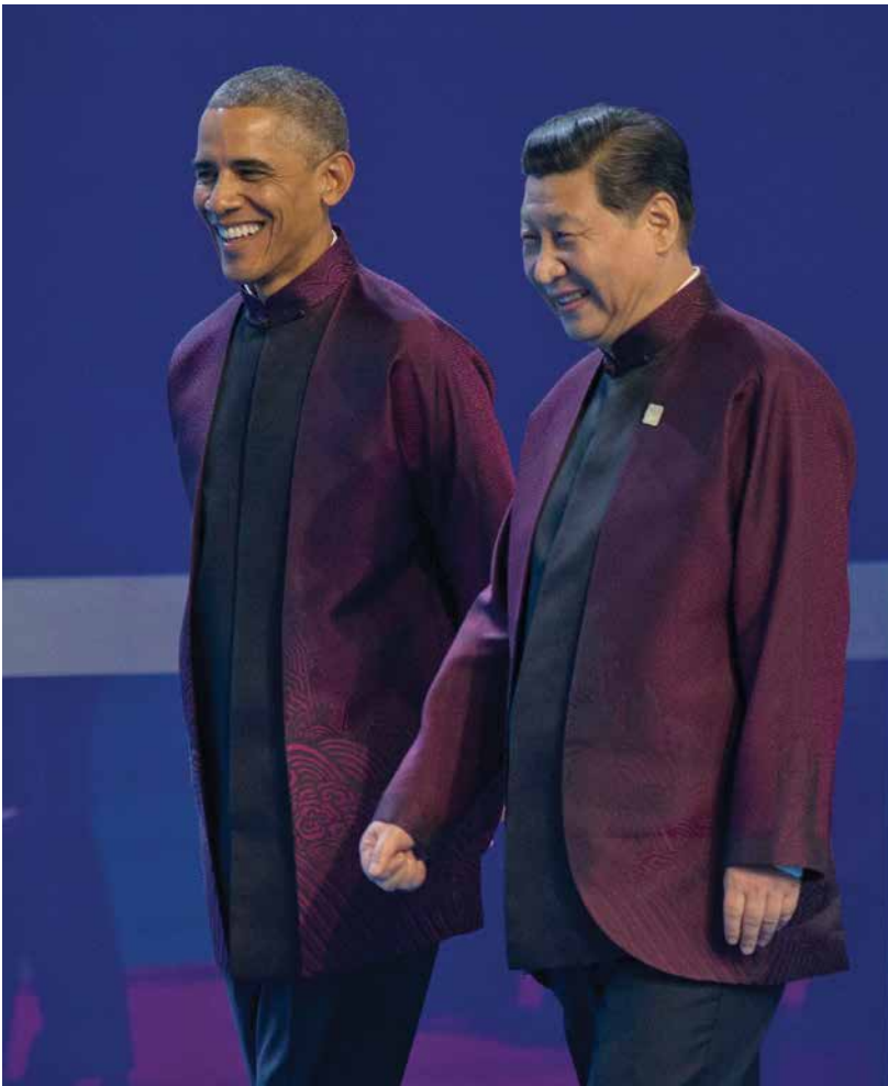
China's President Xi Jinping and US President Barack Obama meet at APEC, Beijing, November 2014.