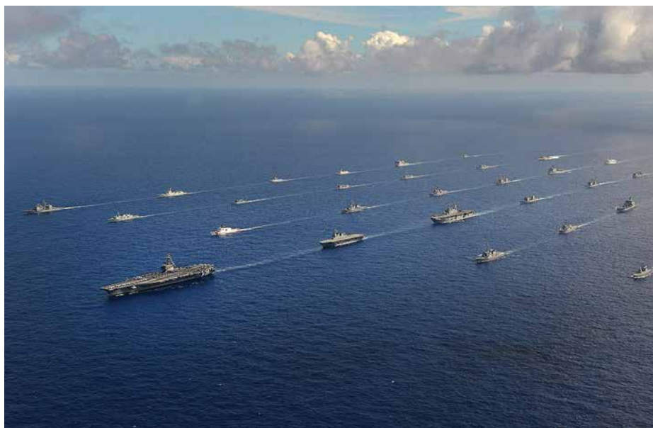
RIMPAC 2014: Ships and submarines from 15 of 22 participating nations, including China for the first time, steam in formation.

Fast-forwarding one year to the waning days of 2014, how are we to assess the present peace and stability of the world's most dynamic region? While there is much to be hopeful about, over the past year the security environment has deteriorated markedly. A more