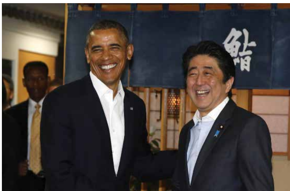
Prime Minister Abe hosts President Obama in Japan, April 2014.

There is no doubt that Prime Minister Abe would like to see Japan have a more robust and muscular foreign policy. There is no question that Chinese worry that Japan will become a more formidable factor in the regional balance of power. And there is good reason to believe that Americans are ambivalent about what they see going on in Tokyo. The Pentagon has welcomed Abe's decision to reinterpret Article Nine of the Constitution to permit collective defence and have Japan make a larger contribution to the alliance. Others in the US government and in the media