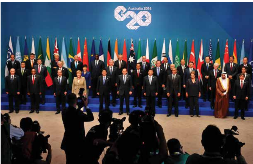
World leaders at the G20 Summit, Brisbane, Australia, 14 November 2014.