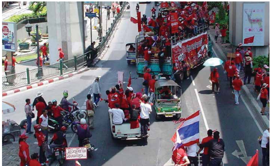
Red Shirts at a rally in Bangkok, 3 April 2014.

Thailand’s long crisis can be portrayed in several different ways. On one level, it is a crisis of a fledgling democracy that has proceeded in fits and starts from 1932 on a topsy-turvy trajectory. On another, it is a crisis of a traditional political order that is out of step with the new popular demands and expectations of the early 21st century. Yet it may also be seen as a crisis that revolves around the self-exiled Thaksin Shinawatra, the deposed and divisive leader whose political party has won all of the elections since 2001. Conversely, this can