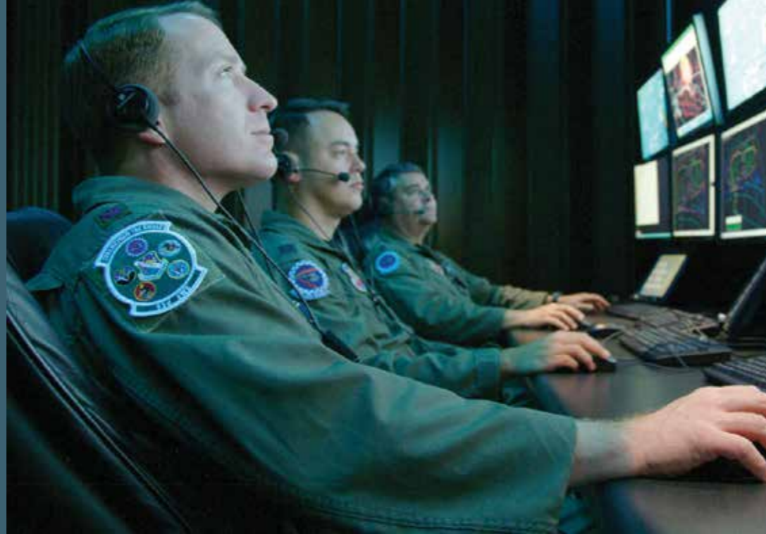
The Central Control Facility at Eglin Air Force Base, Florida oversees electronic warfare mission data.

When someone utters the phrase “cyber war,” one naturally thinks of Russian and Eastern European hackers (these individuals prefer the moniker ‘hackivists’) either trying to plant malware in our computers or trying to steal our bank account numbers. Next come groups like the Syrian Electronic Army, a group of computer hackers loyal to Syrian president Hafez al-Assad, who have gained notoriety by a series of high-profile attacks on the websites of the New York Times and other western media organisations. And at the top end of the spectrum, cyber war includes incidents such as the STUXNET computer virus that was surreptitiously planted by someone (allegedly by the US and Israeli governments) back during the George W. Bush administration into the computers that controlled the centrifuges at the Iranian uranium enrichment plant at Natanz. Cyber attacks of this sort, while garnering vast amounts of press coverage, are relatively rare occurrences.