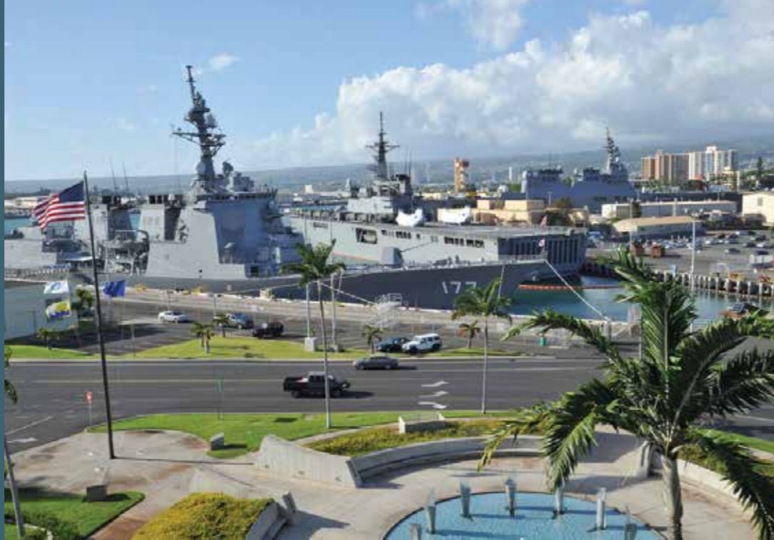
Japan Maritime Self-Defense Force ships, landing ship tank JS Shimokita (LST 4002), destroyer JS Atago (DDG 177) and helicopter destroyer JS Hyuga (DDH 181) are moored along the pier at Joint Base Pearl Harbor-Hickam, 16 May 2013.