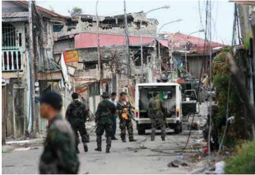
Filipino soldiers during clearing operation in the war ravage district of Zamboanga City, southern Philippines, on 30 September 2013, after the nearly three-week stand-off between government troops and rebels.

of consultation, there was no effective effort to reach out to the MNLF. The government in Manila was content to try and isolate Misuari and stitch up deals with MNLF commanders on the ground using development projects as an inducement. The government even tried to bring to an end the 1996 Final Peace Agreement review process being conducted by Indonesia and the OIC. This turned out to be the trigger for the next phase of MNLF resurgence.