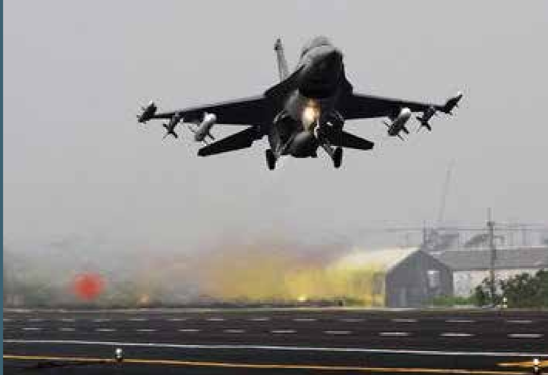
An armed US-made F-16 fighter takes off from the highway in Tainan, southern Taiwan, during the Han Kuang drill on April 12, 2011. The Taiwanese air force used a closed-off freeway as a runway in a rare drill simulating a Chinese surprise attack that had wiped out its major airbases.

“...resolving the cross-Strait relationship will take a very long time ... (and) will also probably require both sides to rethink definitions of basic concepts such as “one China,” sovereignty and unification.”