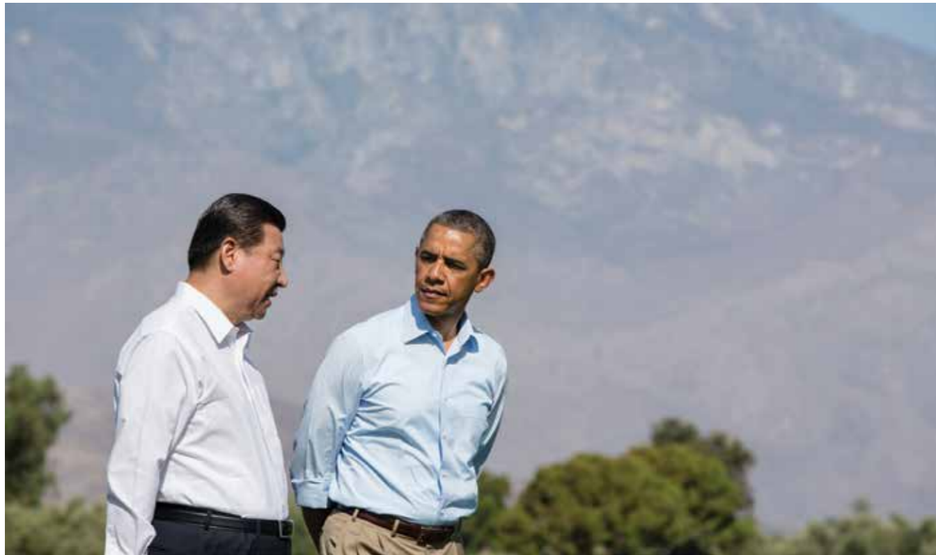
President Barack Obama and President Xi Jinping walk on the grounds of the Annenberg Retreat at Sunnylands in Rancho Mirage, California, before their bilateral meeting, 8 June, 2013.

engagement can no longer keep the ship sturdy.