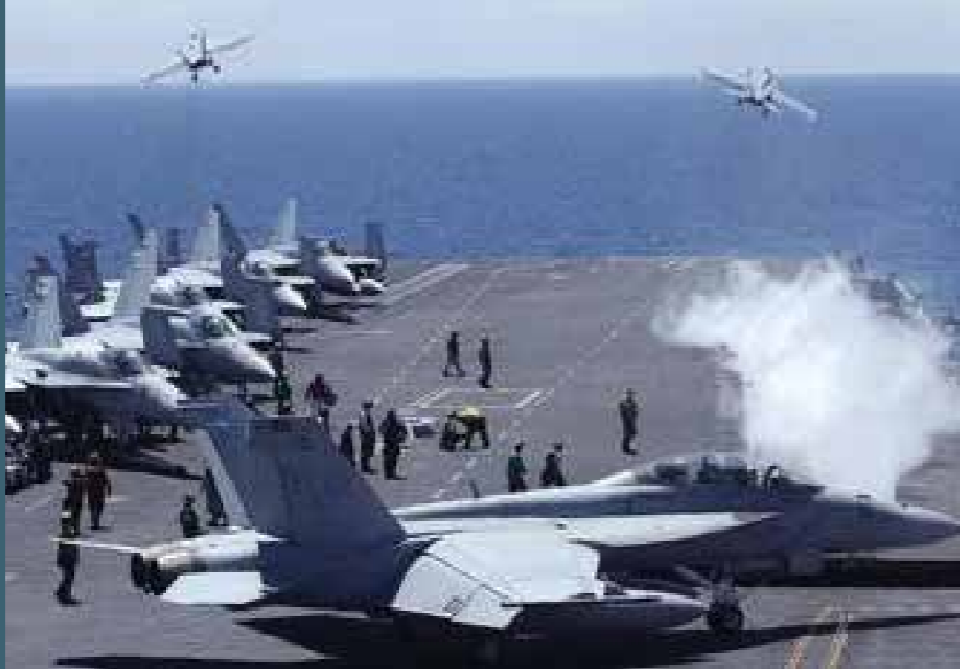
South Korea-North Korea-US military. US fighters take off from the flight deck of the Nimitz-class USS George Washington for joint military exercises between the US and South Korea in South Korea's East Sea on July 26, 2010.