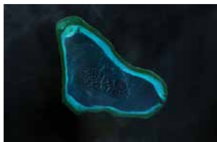
Scarborough Shoal.

Telephone hotlines have been much in vogue in Asia this year. In June, China and Vietnam agreed to establish a hotline to report incidents involving fishing boats. 5 And in August, ministers attending the ASEAN Defence Ministers Meeting (ADMM) Retreat and Second ADMM-Plus in Brunei discussed measures to alleviate friction in the South China Sea, including a hotline to “defuse tensions at sea” as well as a “non-first use of force” agreement that Vietnam had proposed earlier in the year. 6 How the proposed ADMM and ASEAN-China SAR hotlines will fit together remains to be seen.