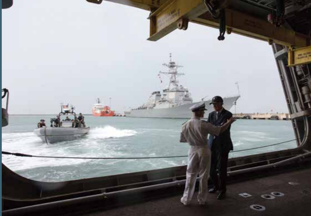
A tactical team demonstration on board the USS Freedom at Changi Navy Base in Singapore, 27 July, 2013.

The situation in the South China Sea during 2013 remained essentially unchanged. Tensions between the claimants continue to fester, fuelled by rising nationalist sentiment over ownership of the disputed atolls, the lure of potentially lucrative energy resources under the seabed, spats over access to valuable fisheries in overlapping zones of maritime jurisdiction and moves by most of the claimant states to bolster their territorial and sovereignty claims by issuing new maps, conducting military exercises and launching legal challenges. Indonesian Foreign Minister Marty Natalegawa observed that the South China Sea exhibited a ‘sense of anarchy’. 1