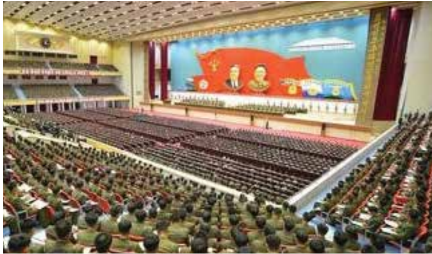
North Korean leader Kim Jong-Un attending the 4th meeting of company commanders and political instructors of the Korean People's Army (KPA) at the Pyongyang gymnasium, 24 October, 2014.

changes in Chinese policy, since they believe the policy doesn't serve China's national interests. Chinese scholars acknowledge (and Chinese officials certainly understand) these drawbacks to the current policy. Yet, China's policymakers have evidently decided to concentrate on the positive effects of a supportive posture, above all, North Korea's value as a buffer.