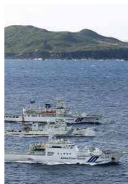
Chinese maritime surveillance vessel (middle) sandwiched by Japan Coast Guard patrol ships near Kuba Island, part of the Japanese-controlled Senkaku Islands in the East China Sea on 2 October, 2012

This lack of solidarity was publicly exposed in July 2012 when, under Cambodia’s chairmanship, ASEAN failed to issue a joint communique for the first time in its history. Consensus could not be reached on whether specific incidents in the South China Sea such as the