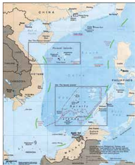
Nine dashed line.

and faced potentially constrained military activities in the newly established EEZ of all other coastal countries.