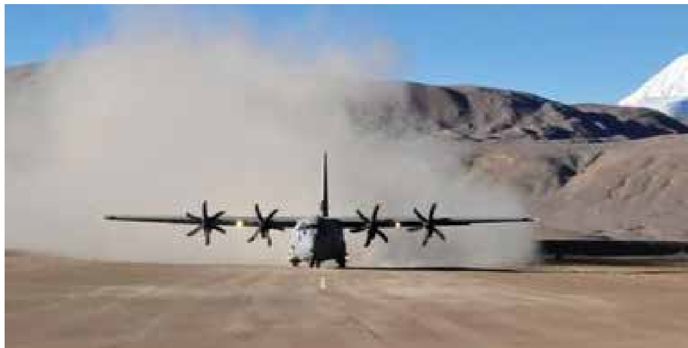
Indian Air Force Lockheed Martin C-130J Super Hercules kicks up a cloud of dust after landing at the high-altitude Daulat Beg Oldie military airstrip in the Ladakh region of the Indian Himalayas on 20 August, 2013.

triangular dialogue with China on Asian security issues. Beijing, however, has shown little interest in such a dialogue. Besides China, a number of other middle powers are not likely to respond positively to a self-selected Asian concert. In the post-Napoleonic era, the Concert of Europe was formed by a set of roughly equal sized powers all of them located within the old continent. In Asia, the varying sizes of the powers, the problems of limiting the geographic scope of the concert, and the pitfalls of excluding key players could complicate the challenge of constructing an Asian concert. A seventh possible scenario is the idea of middle power coalition in Asia that can cope with the challenges from a bilateral strategic dynamic between Washington and Beijing. Asia has a large number of middle powers with an inherited tradition of non-alignment. Even treaty allies of the United States might see such a middle power coalition as a small insurance against the twists and turns in US-China relations. The last few years have seen an expanding network of bilateral defence cooperation agreements and trilateral security consultations between different middle powers in Asia. US allies such as Japan, Korea and Australia have been