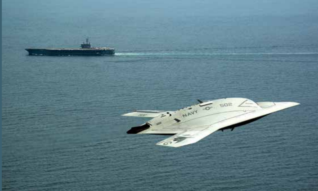
An X-47B Unmanned Combat Air System demonstrator flies near the aircraft carrier USS George HW Bush (CVN 77) after launching from the ship 14 May, 2013, in the Atlantic Ocean. The George H W Bush became the first aircraft carrier to successfully catapult launch an unmanned aircraft from its flight deck.

Competition between the United States and China is inevitable. The question policy makers continue to struggle with is how to balance the competitive dimensions of the Sino-US relationship through a broader context of cooperation. A holistic positive-sum relationship can deter unhealthy and destabilising activities, by merit of the benefits associated with cooperation and the corollary risks of conflict.