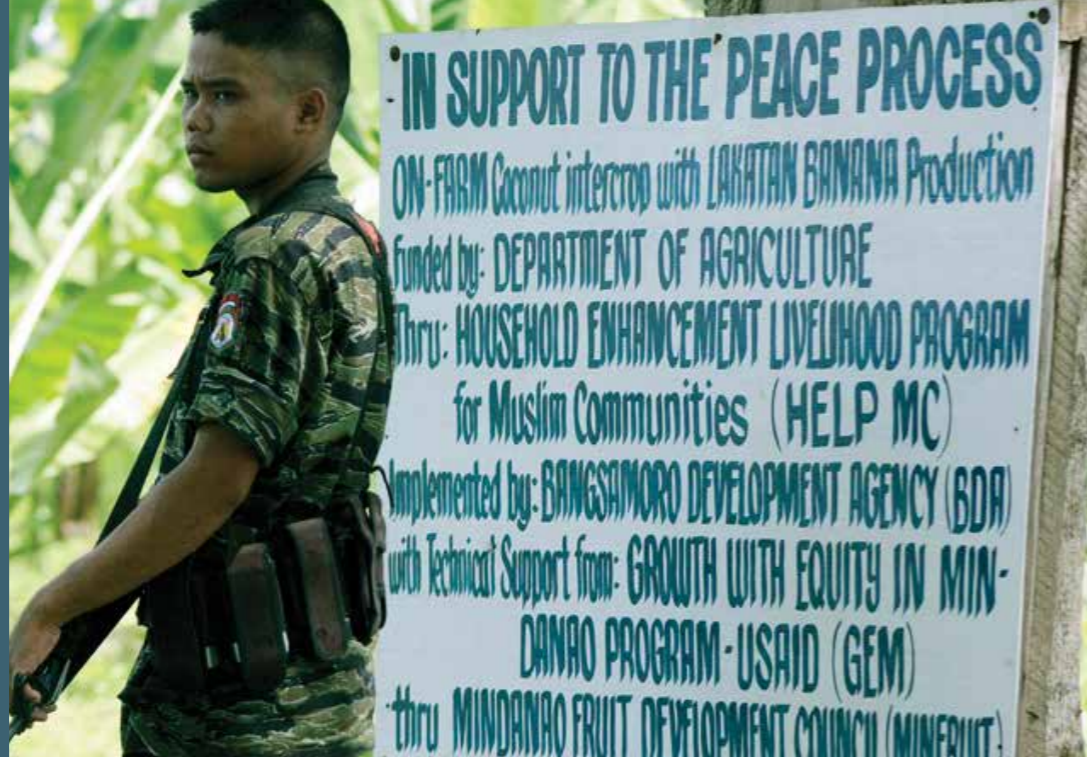
A young Moro rebel inside the MILF Camp Darapanan in Sultan Kudarat.