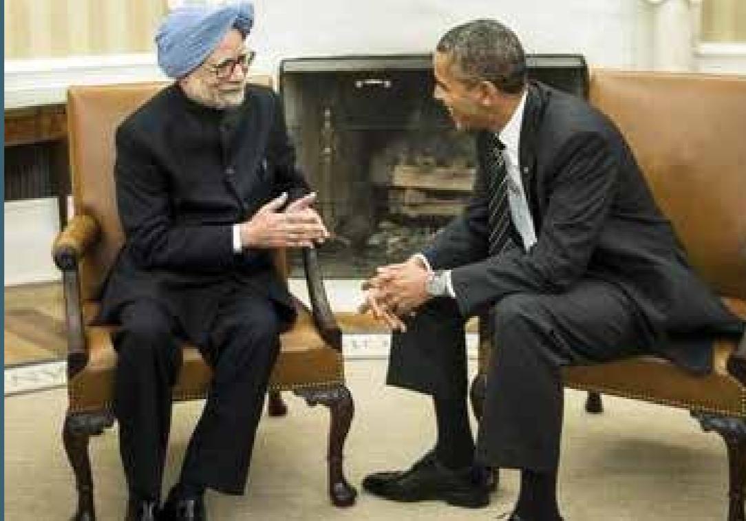
Indian Prime Minister Manmohan Singh with US President Barack Obama in the Oval Office of the White House in Washington DC on 27 September, 2013.

India's dilemmas in coping with the strategic consequences of China's rise and America's response to it are similar to those confronting its fellow Asian states. Until recently East Asia believed that the rise of China was most likely to be peaceful and bet that Beijing could be 'socialized' through a network of regional arrangements. That confidence, however, has been shaken during the last few years amidst mounting tensions between China and the US and between Beijing and some of its neighbours. Meanwhile, the United States, which encouraged its Asian allies to accept Communist China as a legitimate power after the rapprochement with Beijing in the early 1970s and facilitated its economic growth, now confronts a challenger to its long-standing primacy in Asia. India, which was deeply uncomfortable with the Western and Asian embrace of China in the past, now finds itself in a very different quandary as relations between China and America begin to enter a complex and uncertain phase. India, on the one hand, stares at a rare opportunity to shape the Asian balance of power and confronts on the other the real danger of being drawn into the conflict between the world's foremost power and the rising challenger.