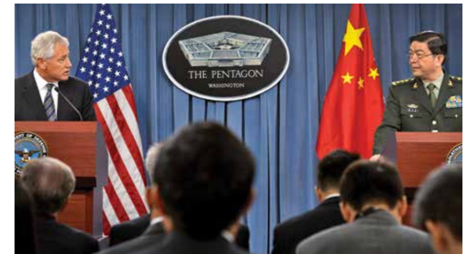
US Defense Secretary Chuck Hagel and Chinese Defense Minister Gen. Chang Wanquan hold a joint press conference at the Pentagon, 19 August, 2013.

Japan's approach to the Diaoyu Islands poses a most serious challenge to peaceful management of the issue. While it refuses to recognise that there is a dispute over the islands, it has further complicated the issue by reasserting its rather controversial position on the history issue. For instance, it insists its right to pay tribute at the Yakusuni Shrine where tablets of Japan's top war criminals are placed, a move that it knows clearly will rouse strong anti-Japanese feelings among its East Asian neighbors, especially China and Korea. China may be in a mood to manage this issue peacefully with Japan. However, as long as Japan refuses to recognise that a dispute over the islands actually exists, China is likely to conclude that there is no reasonable political basis to negotiate with Japan over ways to manage the dispute. As fighters and warships of the two countries maneuver next to each other near the Diaoyu Islands, the potential for