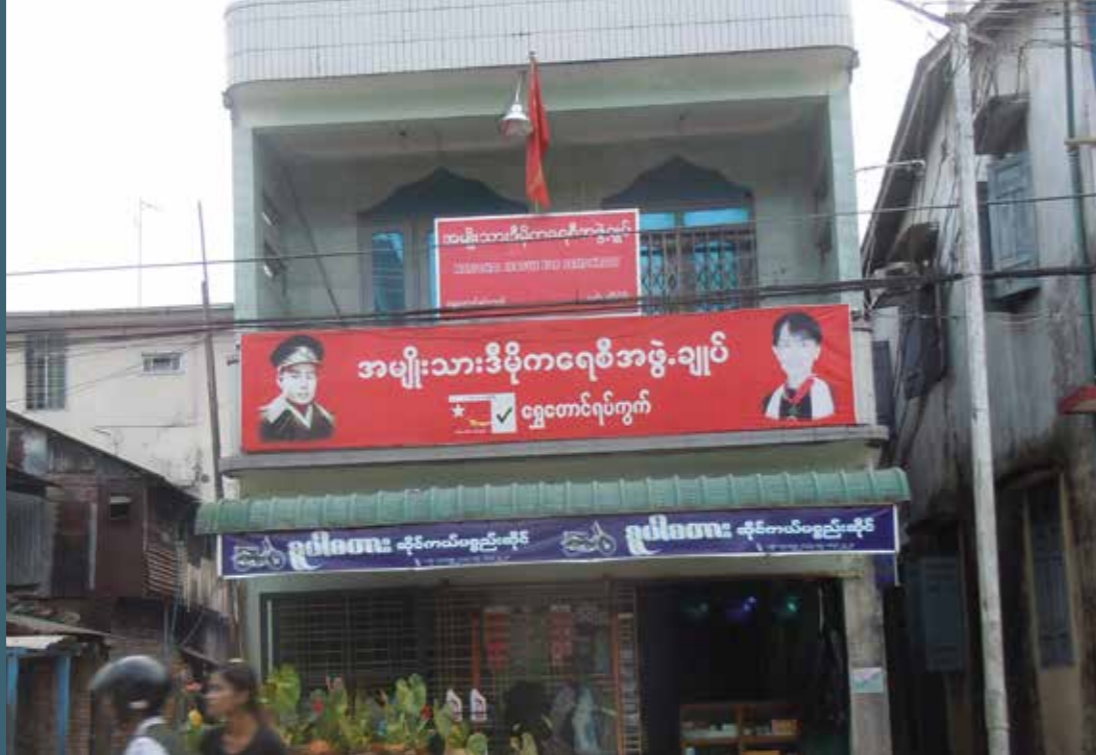
National League for Democracy office, Mawlamyine, Mon State, 2013.

“ Negotiating teams from the Executive and the Parliament are currently engaging fourteen armed groups on issues such as resettlement... demobilisation and reintegration ...so that they can re-join the political process. ”