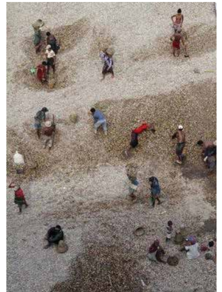
Myanmar daily waged labors unload sand at a construction site, Thursday, Oct 10, 2013 in Yangon, Myanmar.

The military’s economic clout could lead to resistance of democratic reform. A case in point is the parliamentary investigation set up in late 2012 to look into the suppression of protests against a joint venture between the military-owned Union of Myanmar Economic Holdings Ltd and a Chinese mining company.