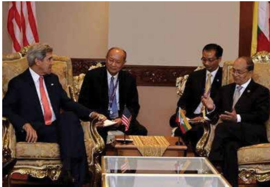
Myanmar President Thein Sein talks with US Secretary of State John Kerry during bilateral meeting in Bandar Seri Begawan, Brunei Darussalam, 10 October, 2013.

Myanmar today is still in the early stages of its transition towards democracy and internal stability. The fast pace of reforms is acknowledged by all stakeholders, though some reform measures have met with more success or approval than others. Civil society