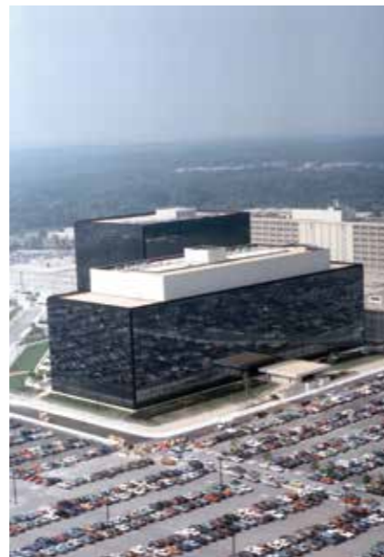
US National Security Agency, Fort Meade.

So not surprisingly, since 9/11, the internet has become the backbone of the NSA's SIGINT collection efforts. In an unclassified White Paper released on August 9, 2013, NSA revealed that it collects only 1.6 per cent of the 1,826 petabytes of traffic currently being carried by the internet. To give one a sense of how much raw data this is, the entire Library of Congress collection, the largest in the world, holds an estimated 10 terabytes of data, which is the equivalent of 0.009765625 petabytes. In other words, the NSA's interception of internet traffic is commensurate to the entire textual collection of the Library of Congress 2,990 times every day. Of this intercepted internet material, according to the NSA, only 0.025 per cent is selected for review by the agency's analysts. This sounds reasonably manageable until one considers that the amount of material in question is the equivalent of 119 times the size of the entire Library of Congress collection that has to be sorted through every day.