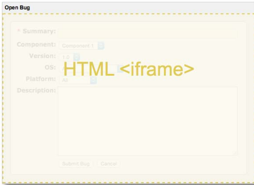
Fig. 2 Dialog iframe

Clients might choose to place dialogs inside page elements styled to look like a dialog window.